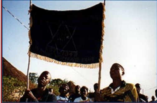
Members of the Lemba tribe.