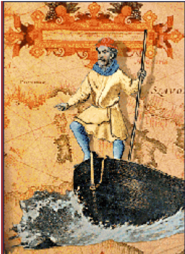
Benjamin of Tudela

Across centuries and continents, the prophetic words instilled hope that one day, brethren would join brethren, and together rebuild the kingdom of God. But first... the Ten Lost Tribes had to be found.