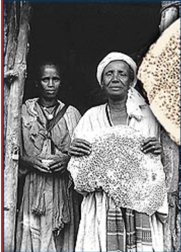
Ethiopian women with qita, unleavened bread baked for passover.