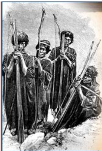
Native Americans from Peru.

journey I took in South America. Now that I am back in Amsterdam, I must share with you some incredible news. There is a Jewish Indian tribe living beyond the mountain passes of the Andes. Indeed, I myself heard them recite the She'ma (the expression of the Jewish faith) and saw them observe the Jewish rituals." Christian theologians awaiting the Second Coming were thrilled to receive this welcome news. For tradition held that when the Ten Tribes were found, reunited and restored to the Holy Land, the messianic age was close at hand.