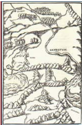
Map depicting the Sambatyon River.

Beyond the Sambatyon || Historical Introduction || Benjamin of Tudela New World Part I || New World Part II || The False Messiah || Tribal Groups Japan || Beta Israel-Ethiopia || Chiang-Min China