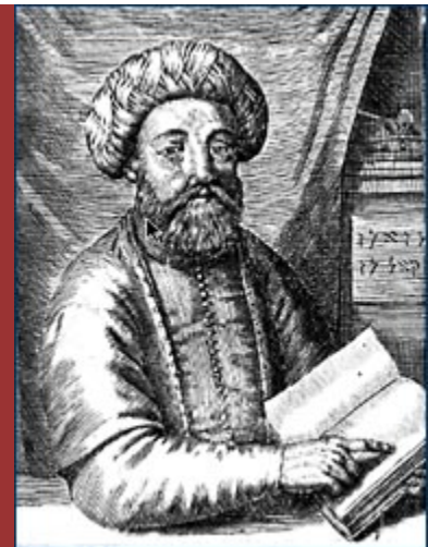
A true portrait of Shabbetai Zevi, sketched by an eyewitness in Smyrna, 1666.

"Hear ye, brethren in Israel that our Messiah is come to life in the city of Ismir and his name is Shabbetai Zevi. Soon, he will show forth his kingdom to all and will take the royal crown from the head of the Sultan and place it on his own. When nine months have passed, our Messiah shall vanish from