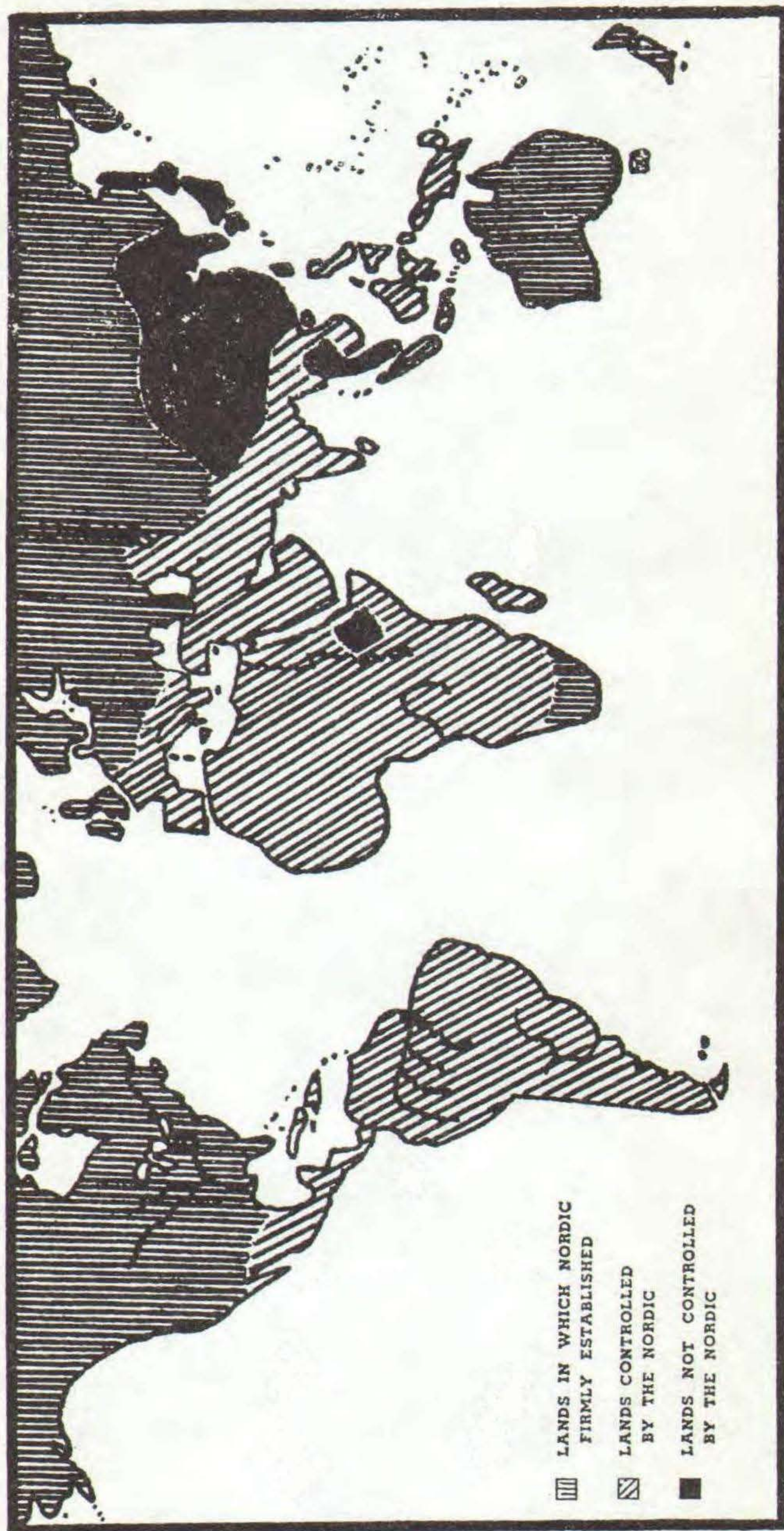
THE NORDIC WORLD IN 1900

but greatly outnumbered by the Red armies who had in their ranks American-trained revolutionaries and who were backed with millions of dollars from America, the White Nordic armies faced annihilation.