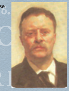
Theodore Roosevelt, whose ancestors included Irvines and Bullocks from Antrim