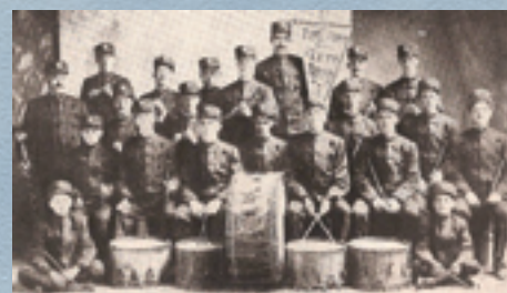
Freedom Flute Band, Chicago, 1912

There were at one time 400 Orange lodges in the United States of America, many of them drawing on Protestant emigrants. The Orange Order continues to exist in the United States, and is a philanthropic movement which helps others in the finest traditions of benevolence.