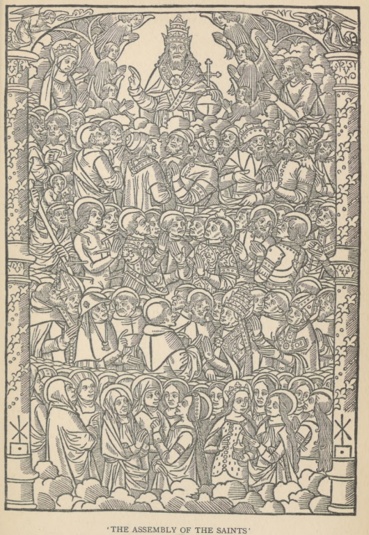
THE ASSEMBLY OF THE SAINTS' Illustration used in Major's In Matthaum Expositio. 1518. This woodcut was used by Notary in 1503, and at Paris by Hopyl in 1505-7 for his Dutch edition of the Colden Legend.