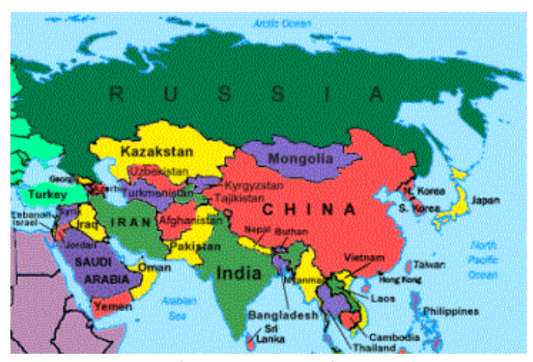
Locations of the descendants of Japheth today

Just as God gives us enough time to repent or show our true colours; just as He allowed Lucifer plenty of time to foment rebellion; so He will allow these forces to develop. The picture we get that these peoples are led by the forces that invaded the nations comprising the Beast power in Europe. As such, they no doubt comprise the remnants of the 200 million army pictured in Rev 9:16.