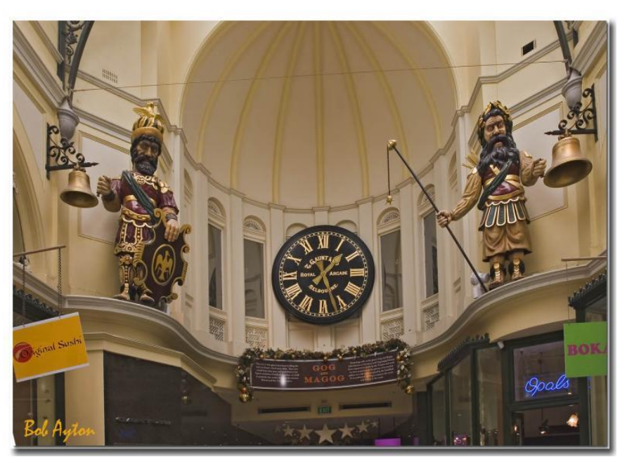
Gog & Magog, Royal Arcade, Melbourne

Now, if Gog and Magog et al, are not the forces during the Great Tribulation which comes against Israel, then who composes the end-time Beast power? Separate papers and booklets are available on this topic at <a href="https://www.friendsofsabbath.org">www.friendsofsabbath.org</a> and various Church of God websites.