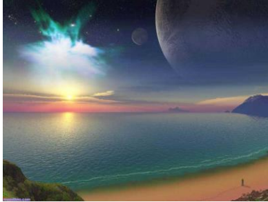
A wonderful, beautiful future awaits you

As such, we also will become replicas of God Himself – divine beings of the God Family.