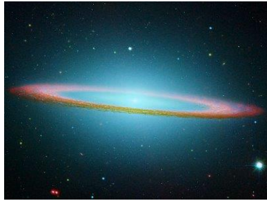
The glory of the Sombrero galaxy taken with an infrared camera

means a thing of beauty and magnificence, fame and honour as we have seen. As such that which is glorious deserves praise and rejoicing in. Similarly, in the Hebrew it means beauty, comeliness, honour, majesty, splendour, rich; while the Greek has the meaning of praiseworthy, dignity, honour, worship.