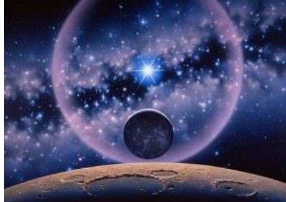
An exciting new spiritual realm at the resurrection!

God, it is said, covers Himself “with light as with a garment” (Ps 104:2). This has nothing to do with the mystical nonsense of the evangelicals with their bizarre ideas such as the meaningless dribble that we will be staring into God's face for eternity. The meaning in Revelation is three-fold: firstly we will be able to actually see God for the first time, literally; we will be enabled to fully see or understand Him at that time as our communion with Him will be so close; and finally, it signifies His blessings being bestowed upon us.