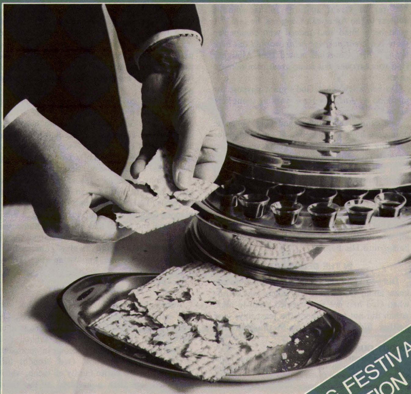
The Spring Feasts