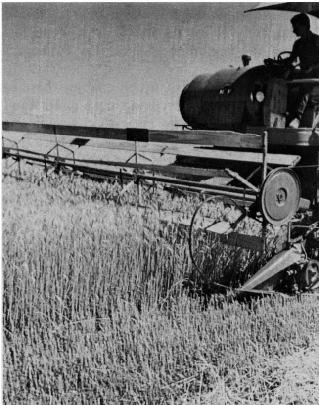
Kansas Wheat Improvement Assoc.

Leaven is used in the Bible as a symbol of sin. Paul said a little leaven leavens the whole lump (I Corinthians 5:6). Just as a little bit of yeast makes a whole batch of dough light and airy, so just a little bit of sin will spread in our