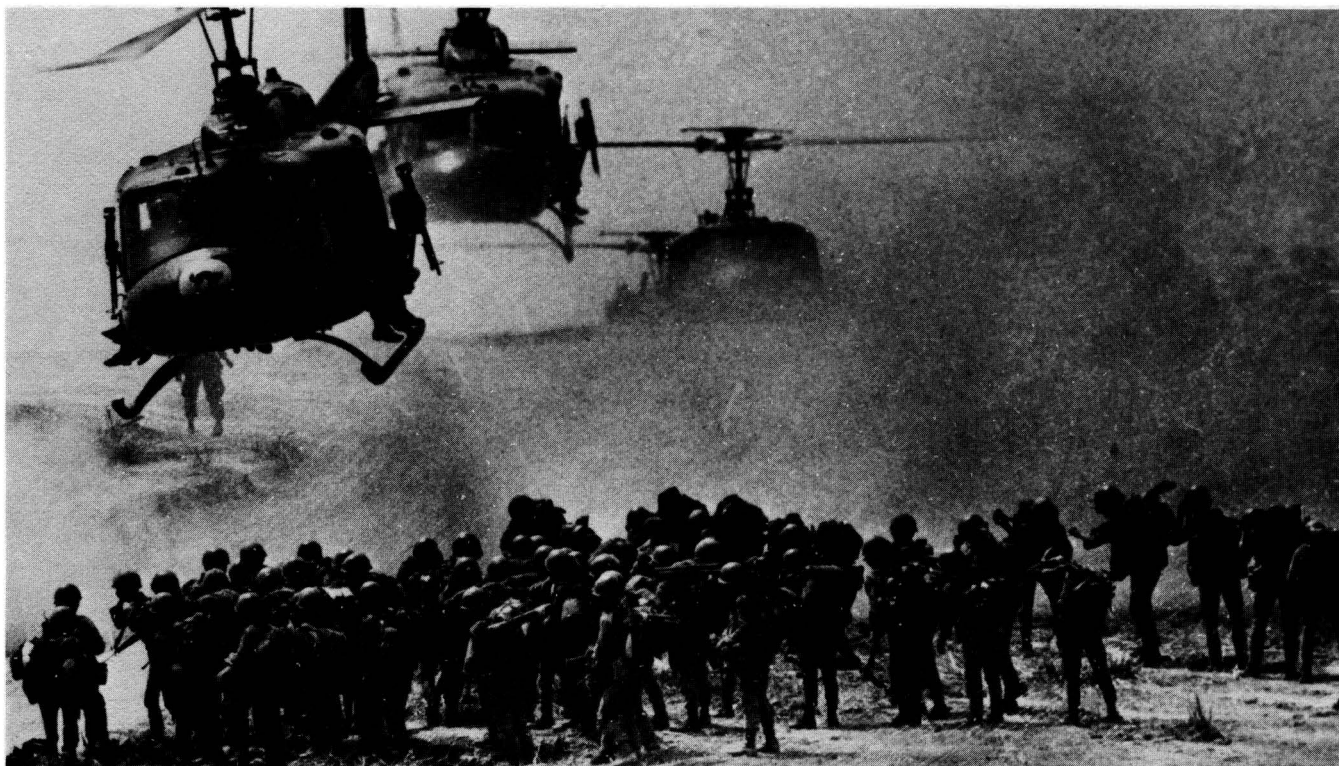
Satan's attitude of rebellion and hatred has caused man to pursue the way of war and death.

Some time after Satan was given power over