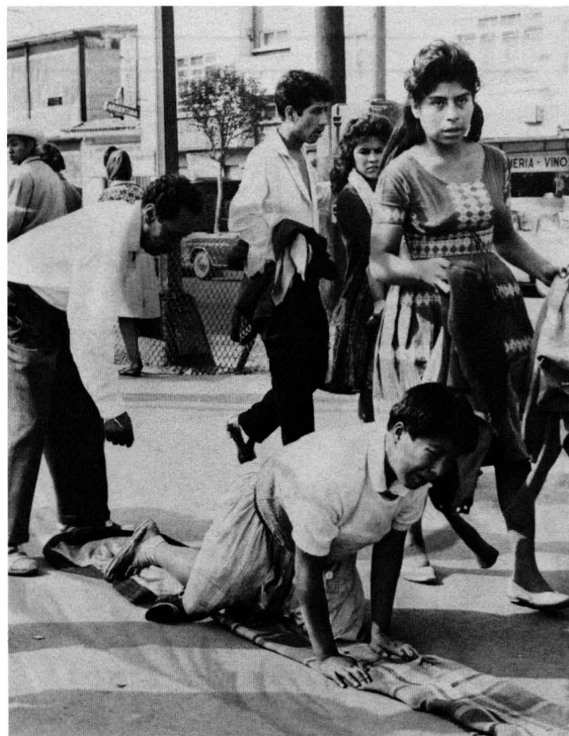
No amount of penance or human works can bring about God’s forgiveness of sin.

True repentance is not a temporary sorrow for sin. It is something much deeper. Godly repentance is a permanent change in the way