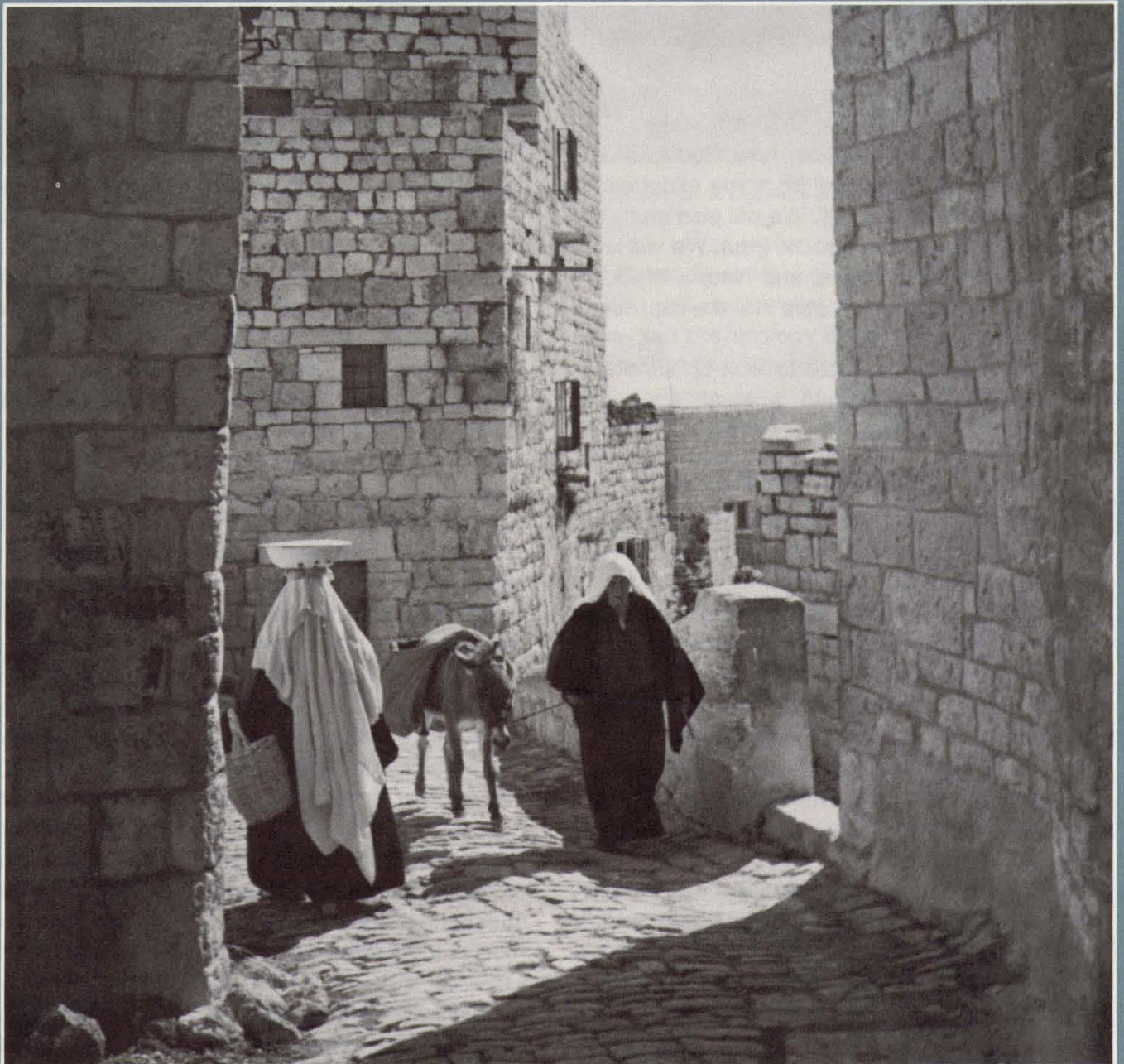
The New Testament Church