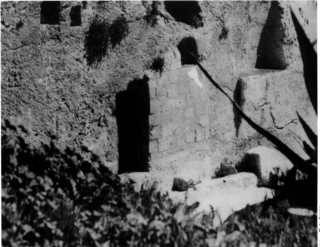
The Garden Tomb is typical of tombs in use at the time of Christ.