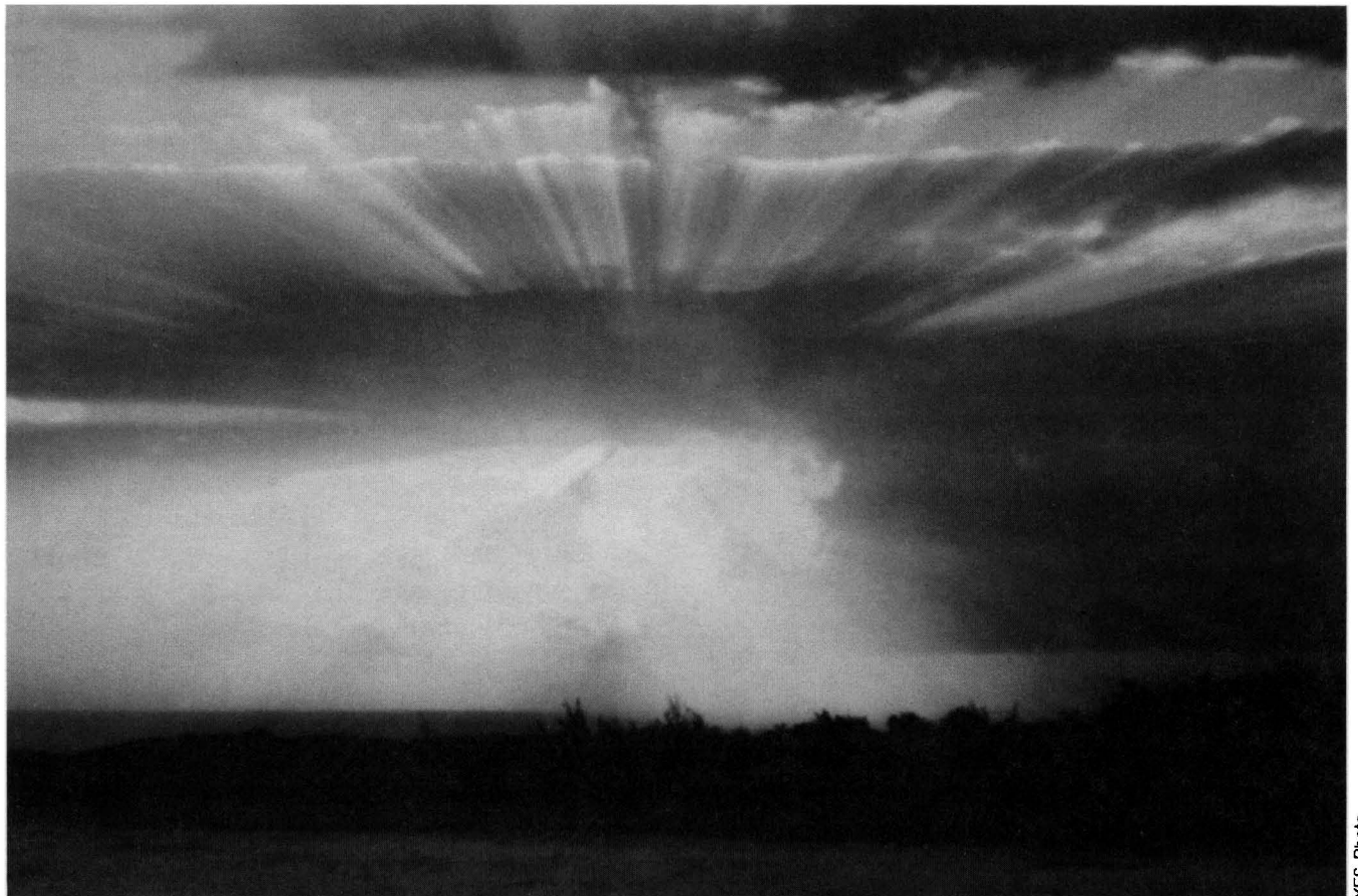
The Bible defines a day as being from sunset to sunset.

Jesus knew that the daylight portion of a day is equal to 12 hours. With three days of 12 hours and three nights of 12 hours, we have a total of 72 hours that Christ had to be in the tomb (John 11:9).