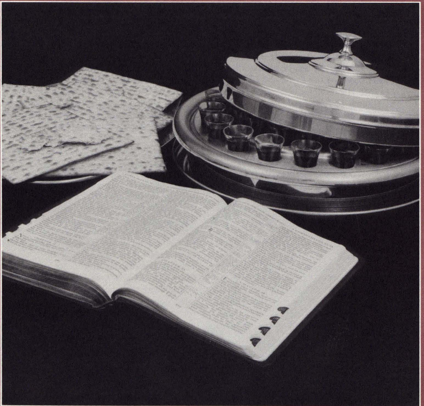
Christ's Final Passover