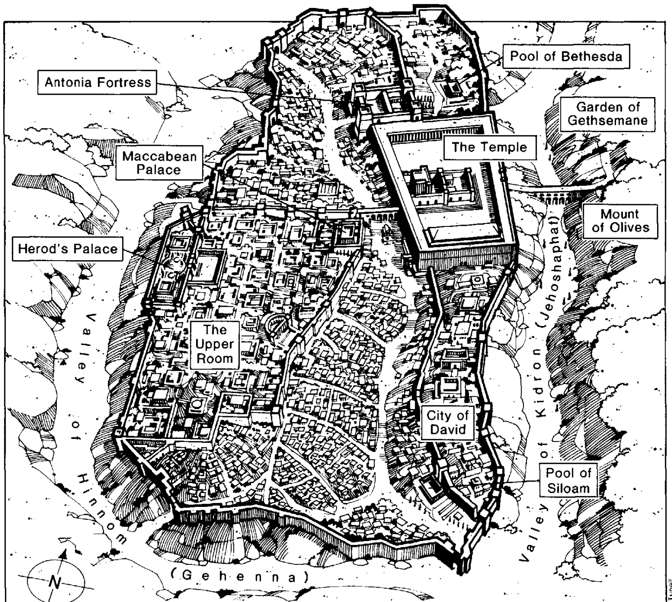
JERUSALEM at the time of Christ