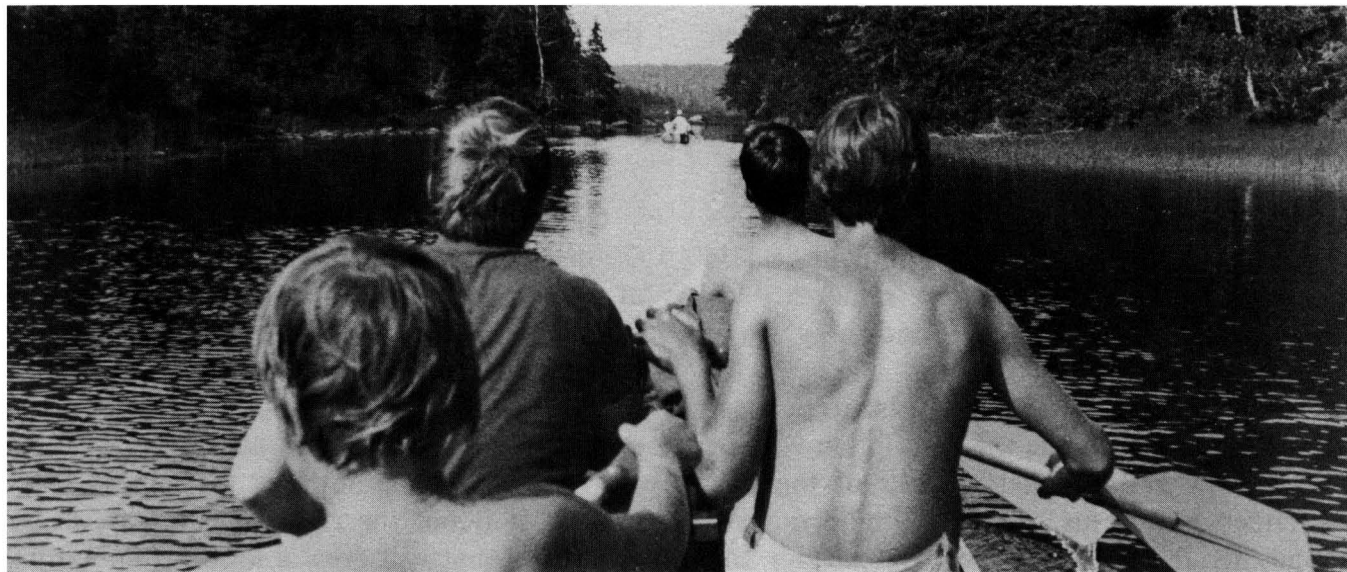
Just as teamwork is necessary for a canoe to go forward in the right direction, so teamwork between members of God’s Church is necessary to do God’s Work today.

Among the first disciples Christ called were Andrew and his brother, Simon. Andrew was a disciple of John the Baptist. One day he and a companion were with John when Jesus walked by them. “Behold the Lamb of God!” said John the Baptist (John 1:36). Andrew and his companion knew that John had always said he