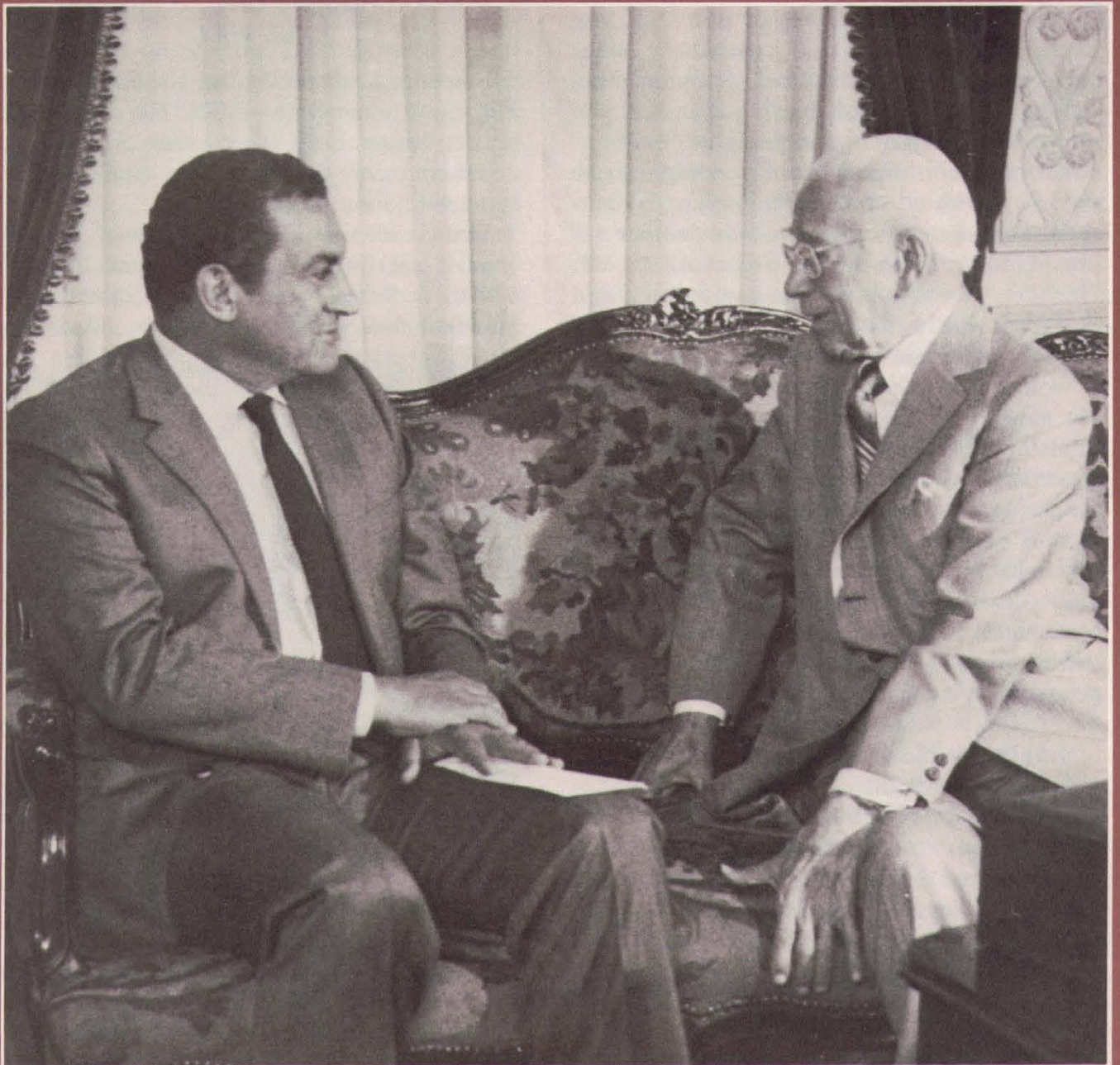
Preparing the Way for Christ's Coming