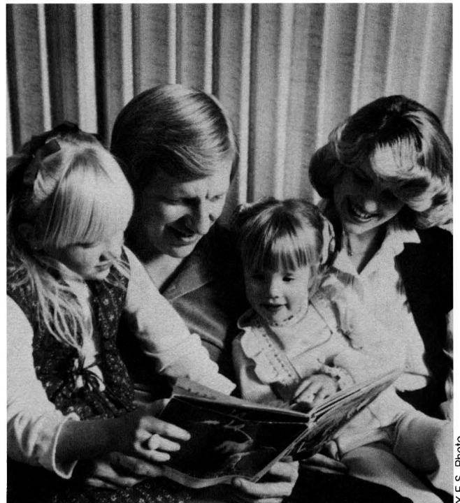
By emphasizing strong marriages and close family relationships, God’s Church is preparing us to become a part of God’s family.

Throughout his ministry John the Baptist emphasized that he was only preparing the way for One to come; One much greater than he. Notice this in Mark 1:7-8: “And John preached, saying, There cometh _____