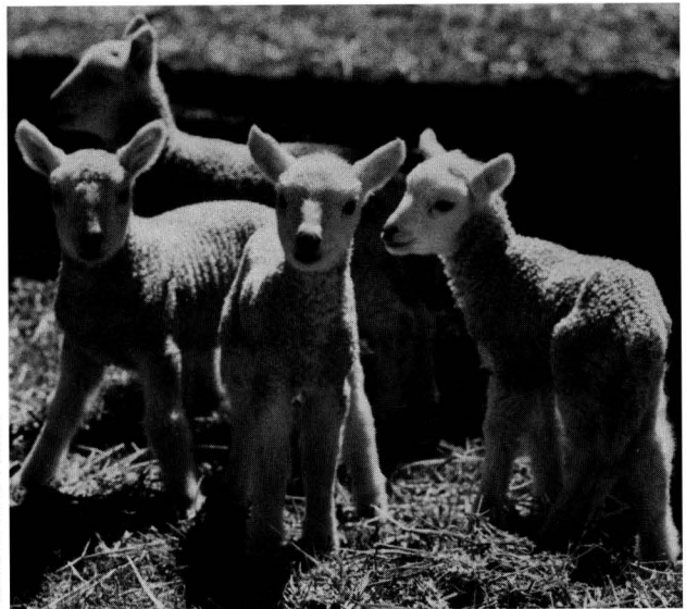
American Stock Photos

Now that we understand what Jesus Christ