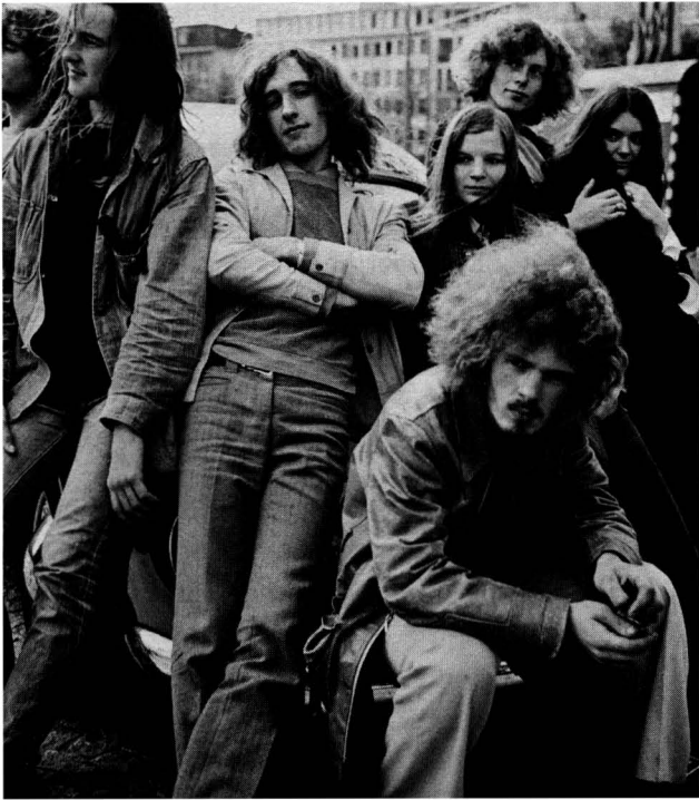
What does the Bible say about long hair?

her for a covering." What is a woman given her for a covering? _____. So the covering of the head talked about in this chapter is hair, and more specifically, the length of the hair. What kind of hair is shameful or disgraceful for a man to have? (See verse 14.) _____ The Greek word for "long hair" means ornamental "tresses of hair." Look up the word tresses in a dictionary and write its definition: _____