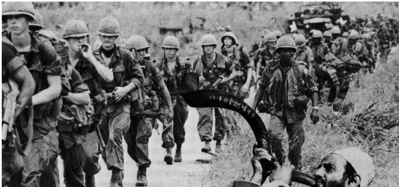
The shofar alerted ancient Israel to various things such as approaching armies. A mighty trumpet blast will announce Jesus Christ's return.

Now let's zoom ahead in time to see what meaning the clue of the trumpet blowing holds for your future. Set your time and space machine to I Thessalonians 4:16. An image begins to come into focus in the distance. You see a brilliant light streaking through the sky right toward you! You're filled with awe and wonder. But don't be frightened. What you are