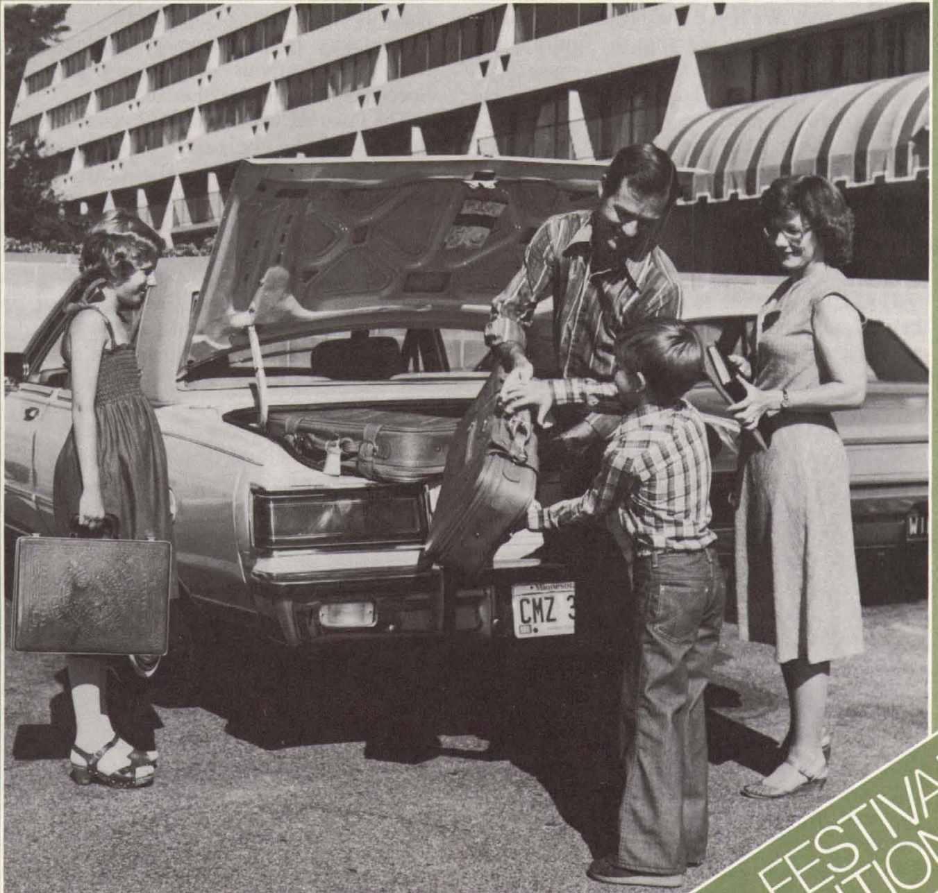
The Festival Mystery