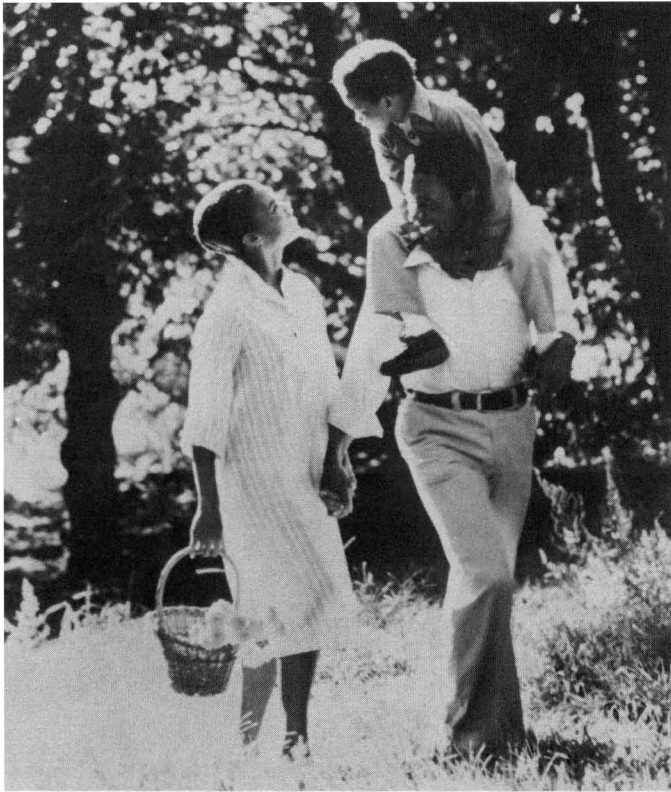
Four by Five