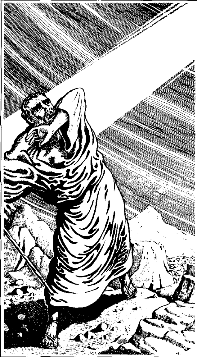
God fulfilled His promises to obedient Abraham by greatly blessing his modern-day descendants.

bestowed (Genesis 48). And as a careful study of history shows, the modern-day descendants of Ephraim and Manasseh—formerly the leading tribes of the house of Israel—are Britain and the United States today.