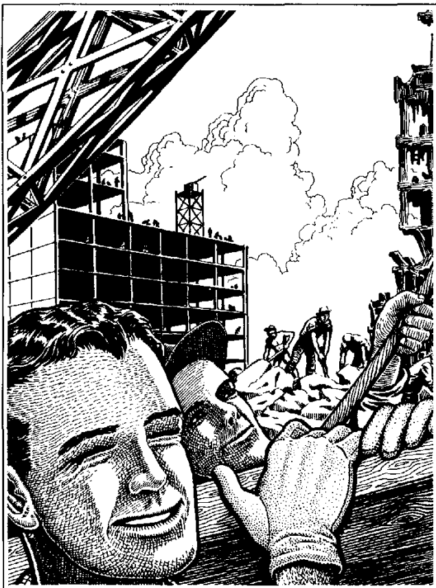
The devastated cities will be rebuilt after Jesus Christ returns to earth.

The gruesome sacrifice of Christ shows that