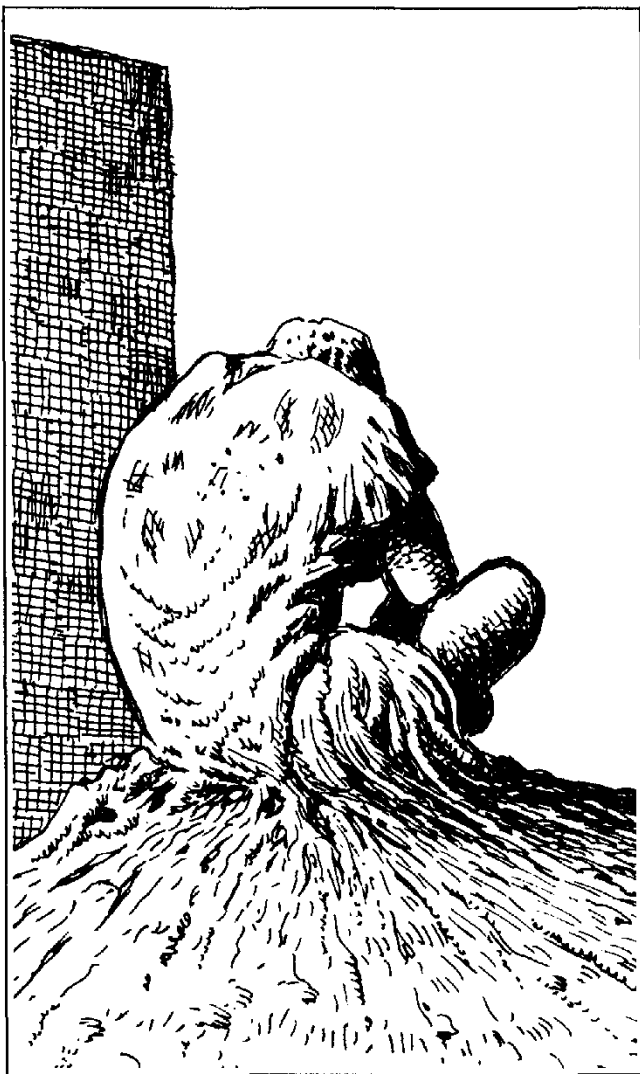
After hearing of the decree to kill the Jews, Mordecai put on sackcloth and sat in ashes, a sign of great distress.

Haman's wife, Zeresh, and his friends tried to console him. "Why don't you build a huge gallows and tomorrow ask the king to hang Mordecai? Then you can go merrily to the