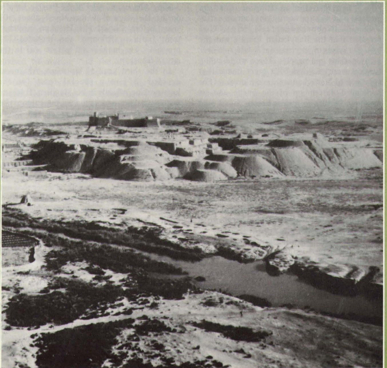
Esther—A Brave and Courageous Woman