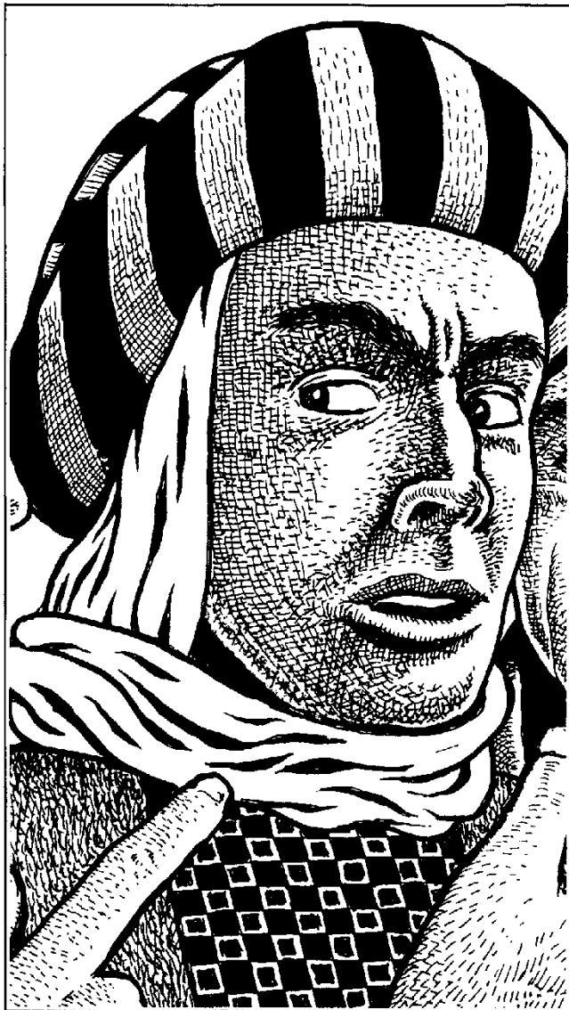
Mordecai was deeply concerned when he heard of a plot to kill King Ahasuerus.

What would you have done if you had learned of the plot? Would you have been afraid and kept silent? After all, suppose you reported the information and no one believed you. You might lose your job. Or, the attempted assassins might want to hurt you out of revenge.