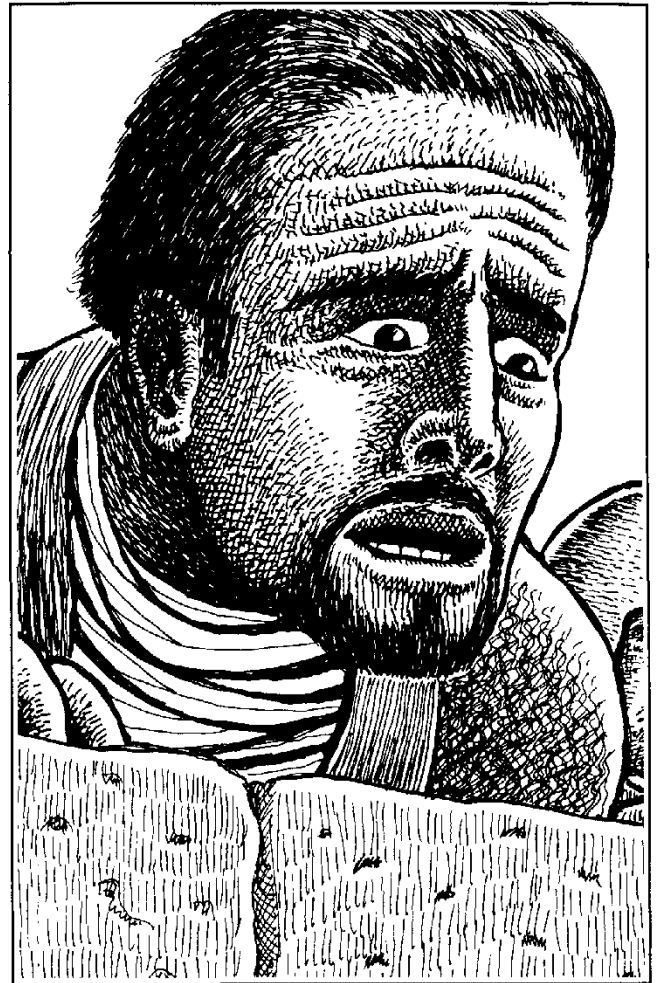
Expecting himself to be led through the streets on the king’s horse, Haman was shocked when told that Mordecai would receive this honor.

The following verses, which show what happens to those who are filled with pride, were about to be fulfilled in Haman’s life. Be