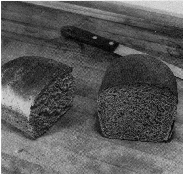
People are commanded to put leavened bread from their homes, symbolizing the putting away of sin from their lives.

know where Jesus, “ key puzzle piece ,” fits into God’s overall plan. And God will show you where this piece fits, as you grow older and try harder to please Him.