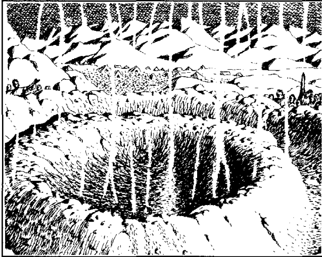
A fireball from God totally consumed Elijah's sacrifice, leaving only a blackened crater.