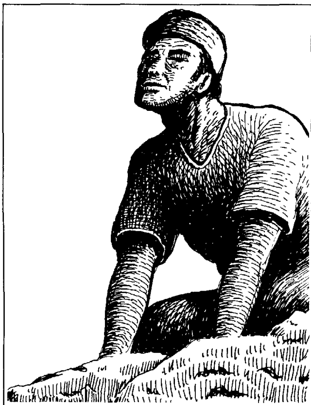
Elijah's servant watched intently from the top of Mt. Carmel for any sign of rain.