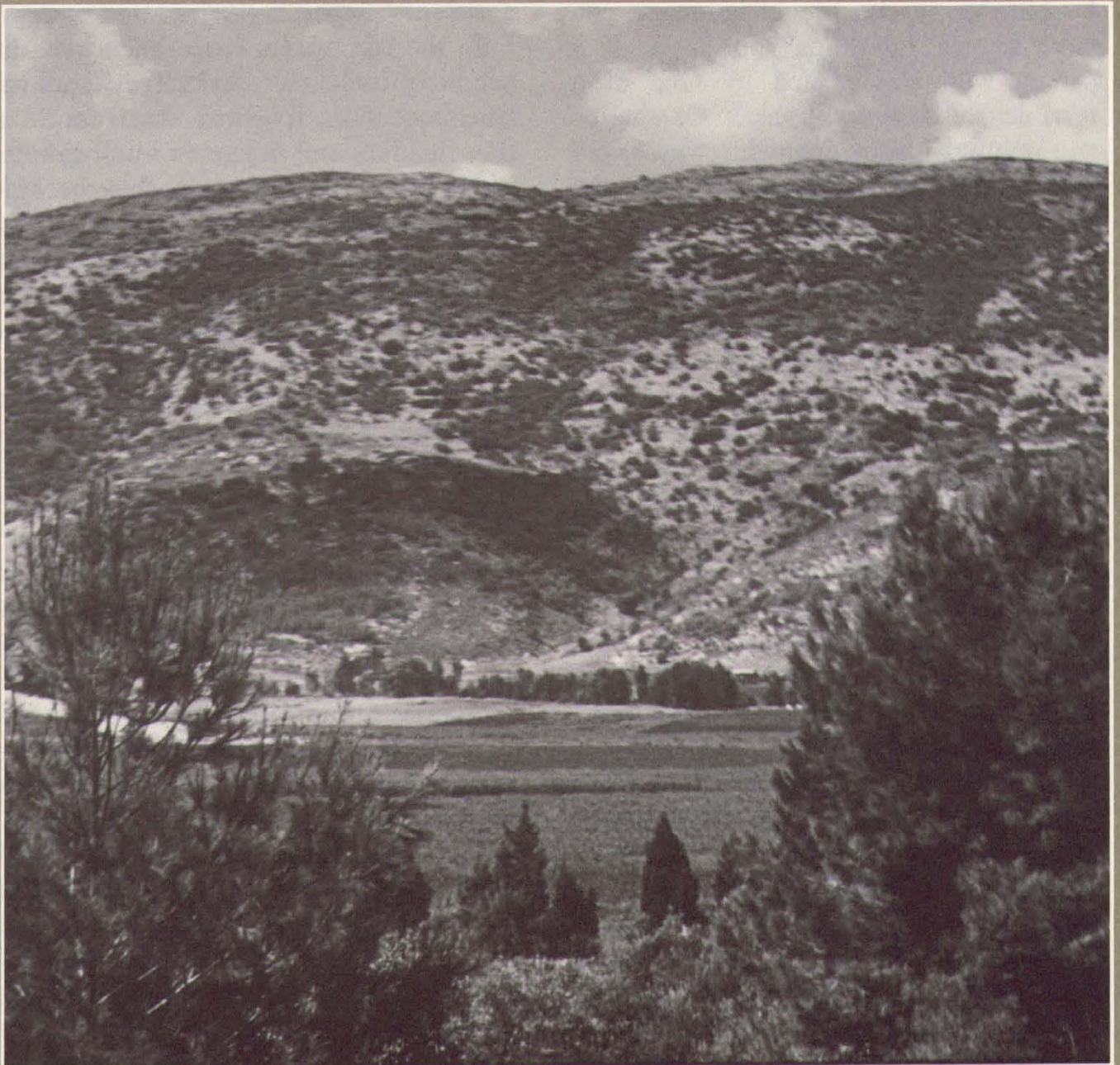
Elijah—A Man of Miracles