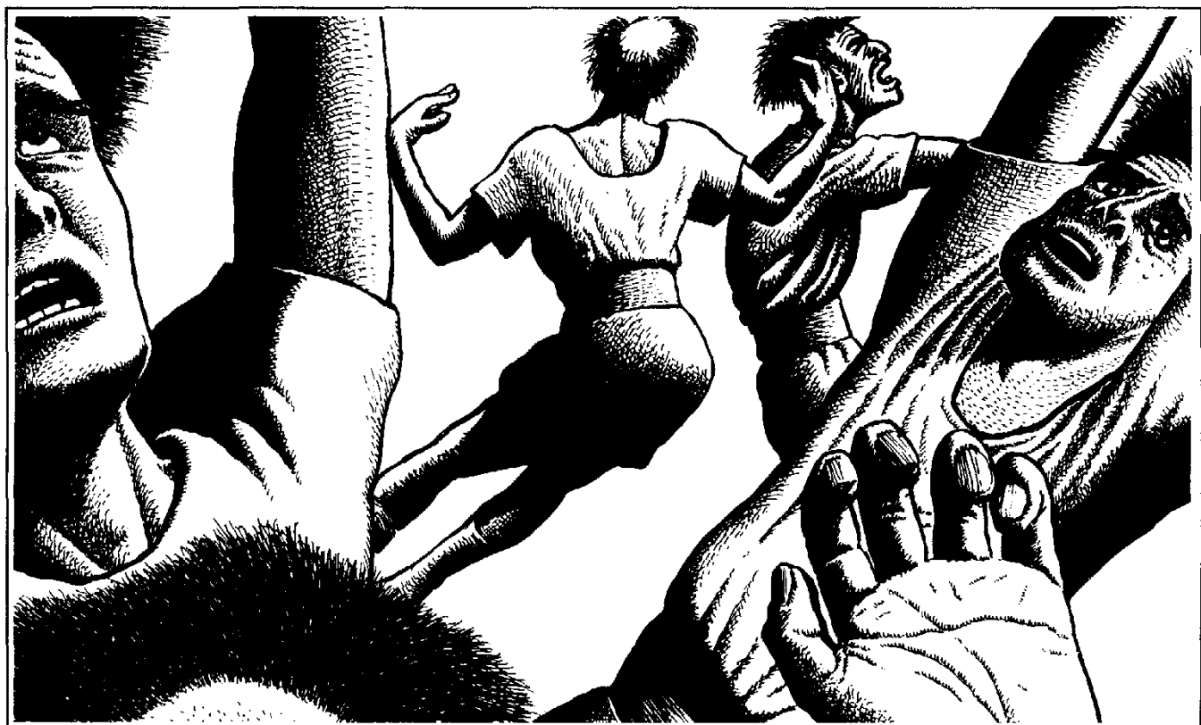
The prophets of Baal danced and sang wildly for hours, hoping their god would answer with fire.