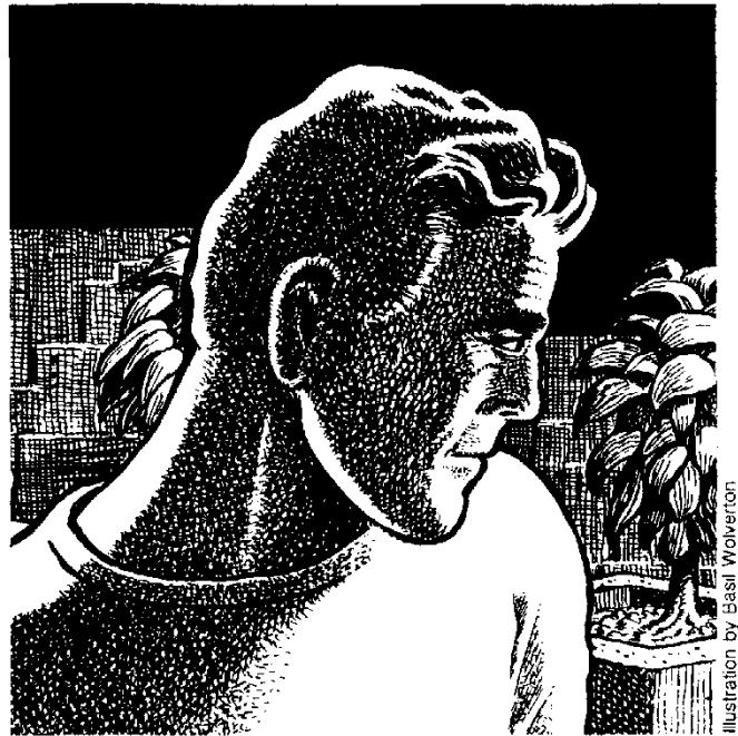
David noticed Bathsheba from his palace roof.

But David's plan failed. Uriah refused to see his wife out of respect for his fellow soldiers on the front. "Why should I go and enjoy myself with my wife while my fellow soldiers are enduring the hardness of battle? I will not go and see her!" (II Samuel 11:11-13.) David suddenly felt trapped. He feared what the people might do if