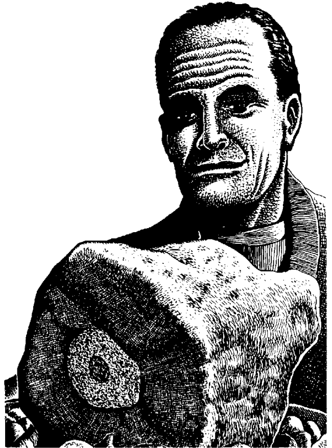
Saul was placed at the head of the table as God’s newly appointed king of Israel.

received God’s Spirit, Samuel called all of the people together. When lots were cast for all the people, Saul’s name was taken. This was God’s way of showing Israel whom He had chosen as king.