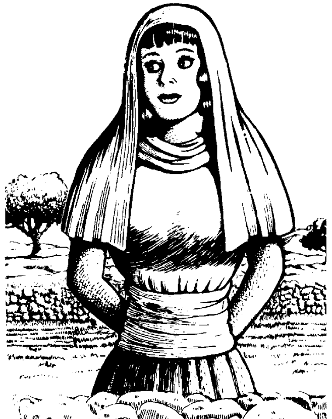
Ruth set a good example with her hard work.

Ruth set a good example that we can all follow: work hard with all your might and you will be blessed. Ruth was given a raise by Boaz. She didn’t know it, but the extra grain or corn was a bonus for her hard work.