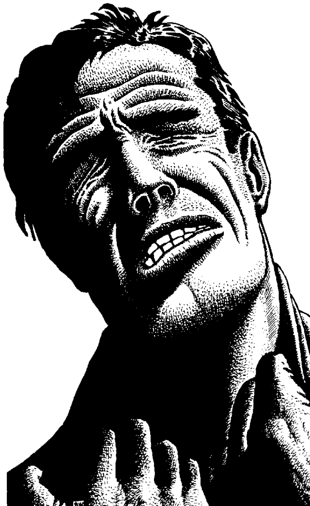
Because Saul was disobedient, God rejected him as king of Israel and withdrew His protective spirit from him.

The story of David's kingdom and the trials he had to go through before he received the kingdom will begin in Lesson 3.