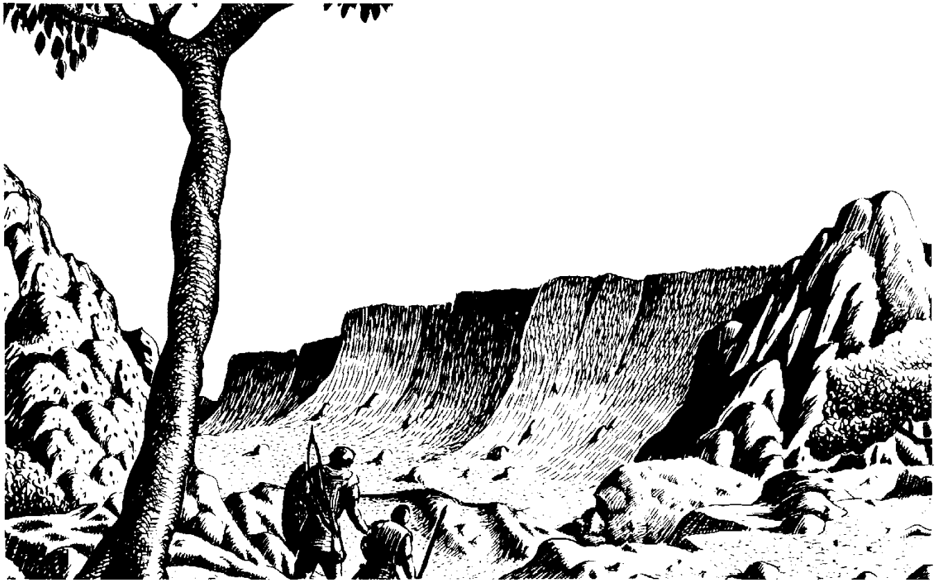
Jonathan and his armorbearer went boldly down into the valley, trusting God to defeat the Philistines.

God did not need a huge army to defeat the Philistines.