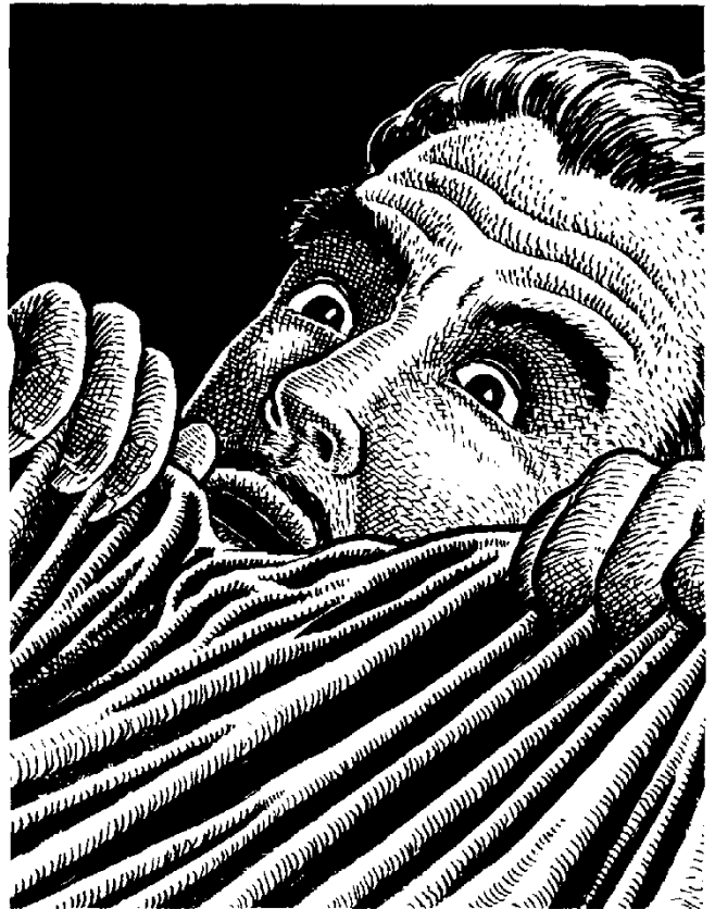
Boaz awakened after midnight to feel something pressing against his feet!