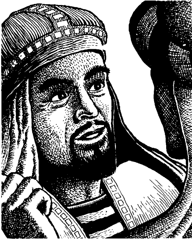
Boaz instructed the harvesters to leave a little extra grain for Ruth to gather.

In fact, Boaz was so pleased he told Ruth: "Don't go to any other fields to glean. You are always welcome here."