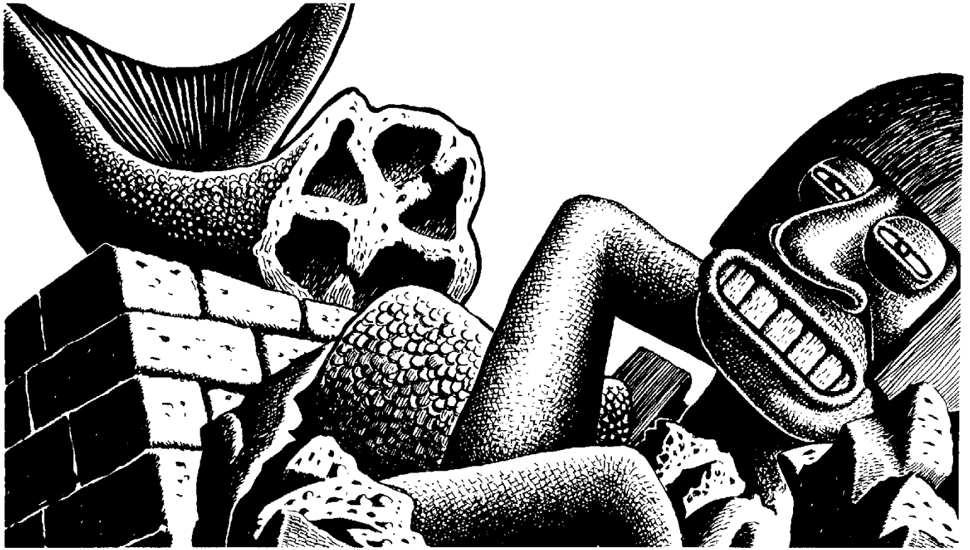
The Priests of the temple of Dagon were shocked to find their idol had fallen toward the ark, and the arms and head were broken off.