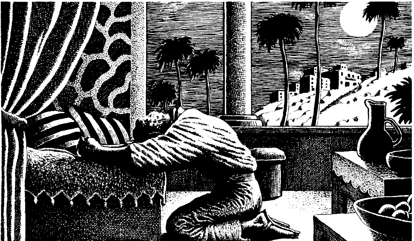
Whenever Samuel needed help, he prayed to God and asked what to do.

So Samuel told them everything. He told them what a king would do: take their sons to fight in his army, their daughters to be his servants and cooks; take their fields and vineyards, their sheep and cattle. Whatever the king wanted, he would take from them (I Sam. 8:11-18).