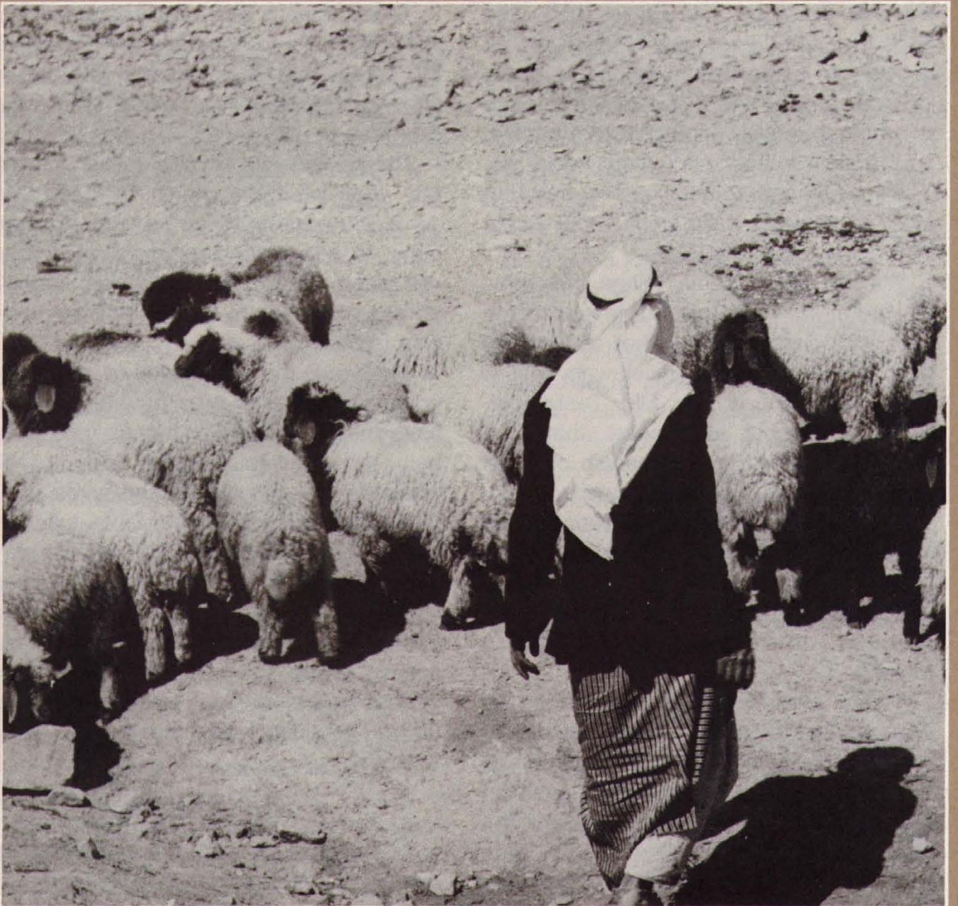
The Early Years