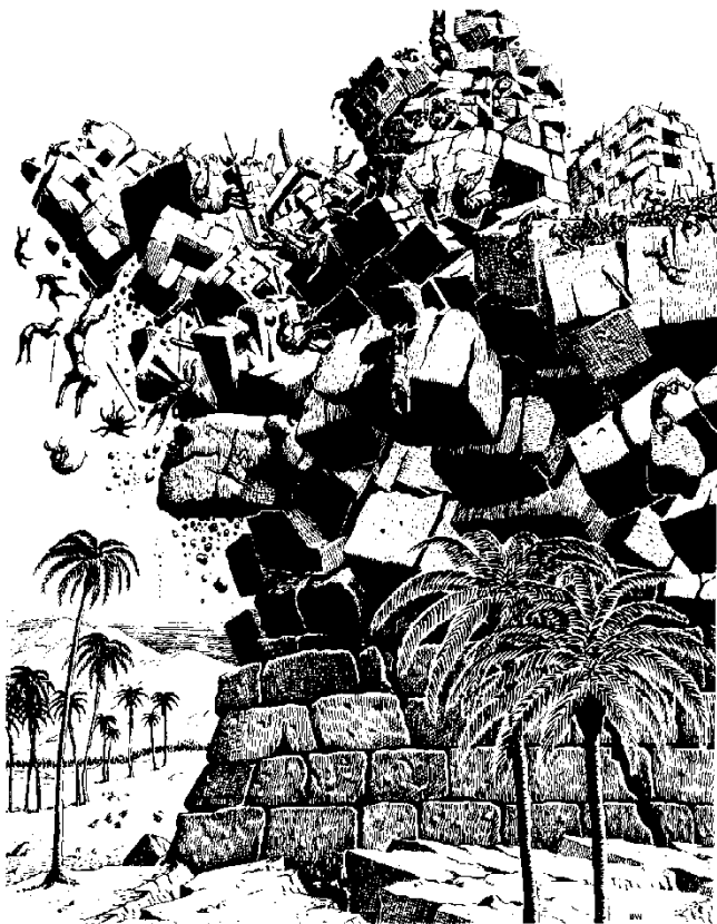
The walls of Jericho tumbling down at the final trumpet blast.