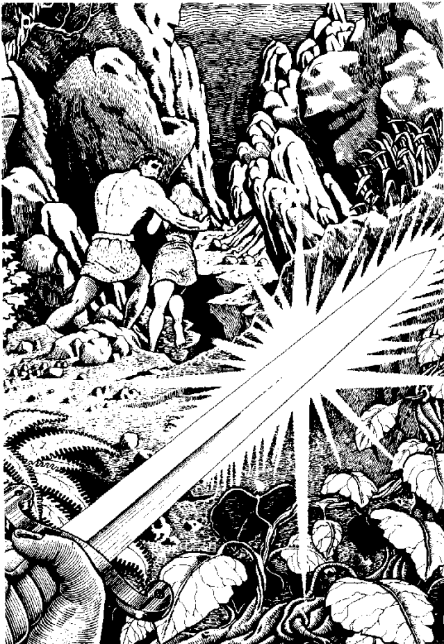
Adam and Eve being driven from the Garden of Eden for not obeying God.