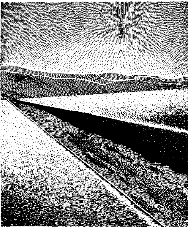
God opening the Red Sea, allowing the Israelites to escape.

God told Moses to go to Pharaoh and tell him to let the people of Israel go. But Pharaoh refused to let them go.