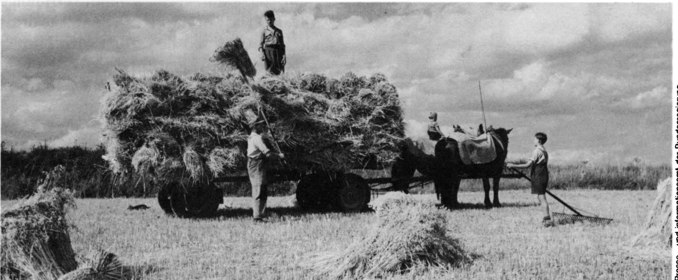
Presse- und Informationsamt der Bundesregierung

The Feast of Trumpets is a joyful day because it pictures a happy new beginning under God’s government. But before God’s government can make this