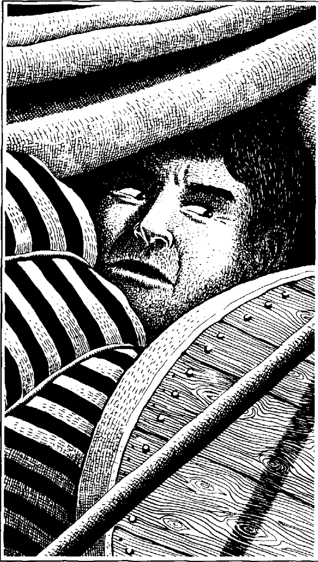
Embarrassed and nervous, Saul hid himself among a large pile of equipment.

which tribe and family their king would come from, Saul was chosen. The people became excited. They waited with suspense for Saul to come forward onto the platform.