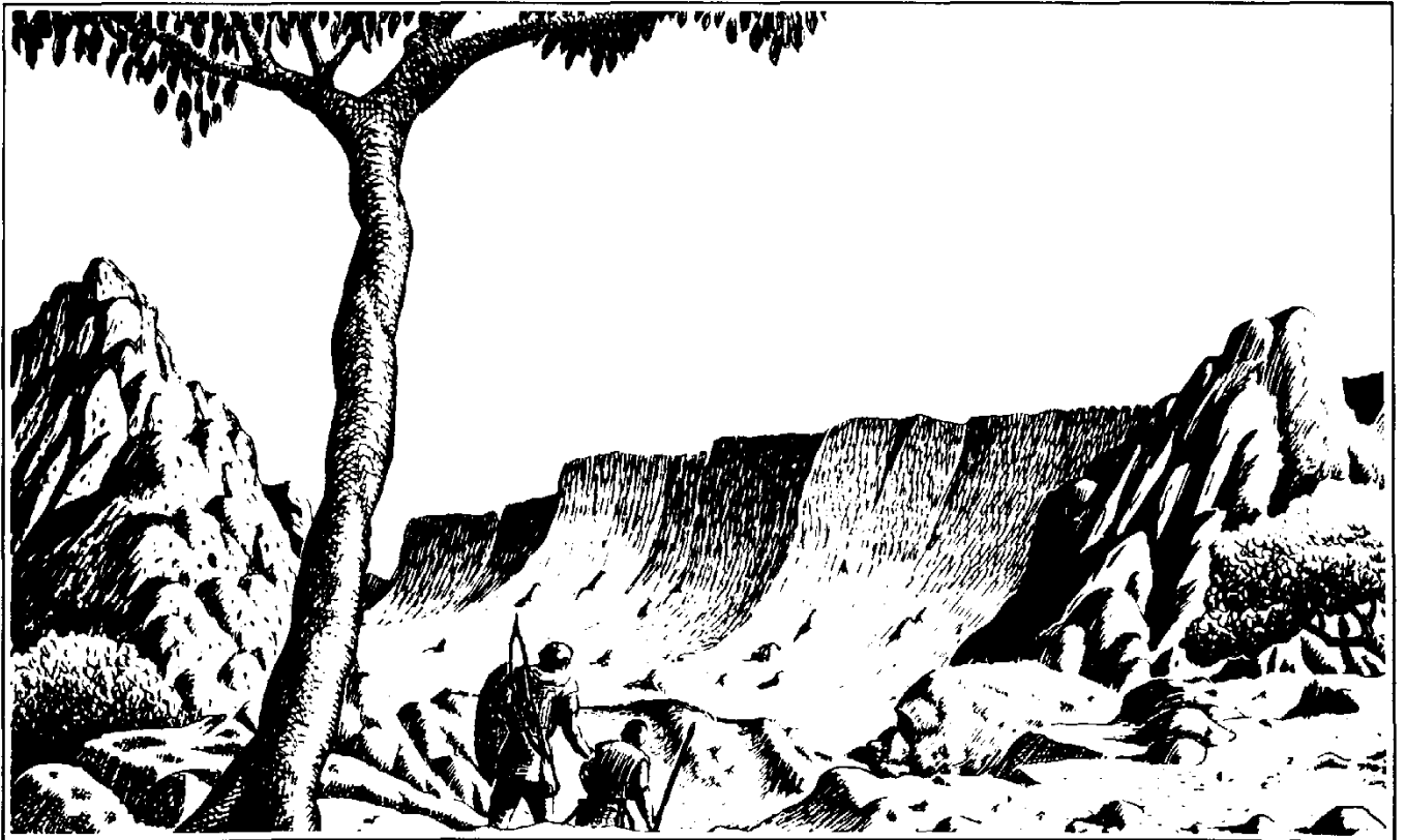
Jonathan and his armorbearer secretly cross the valley to the Philistine camp.