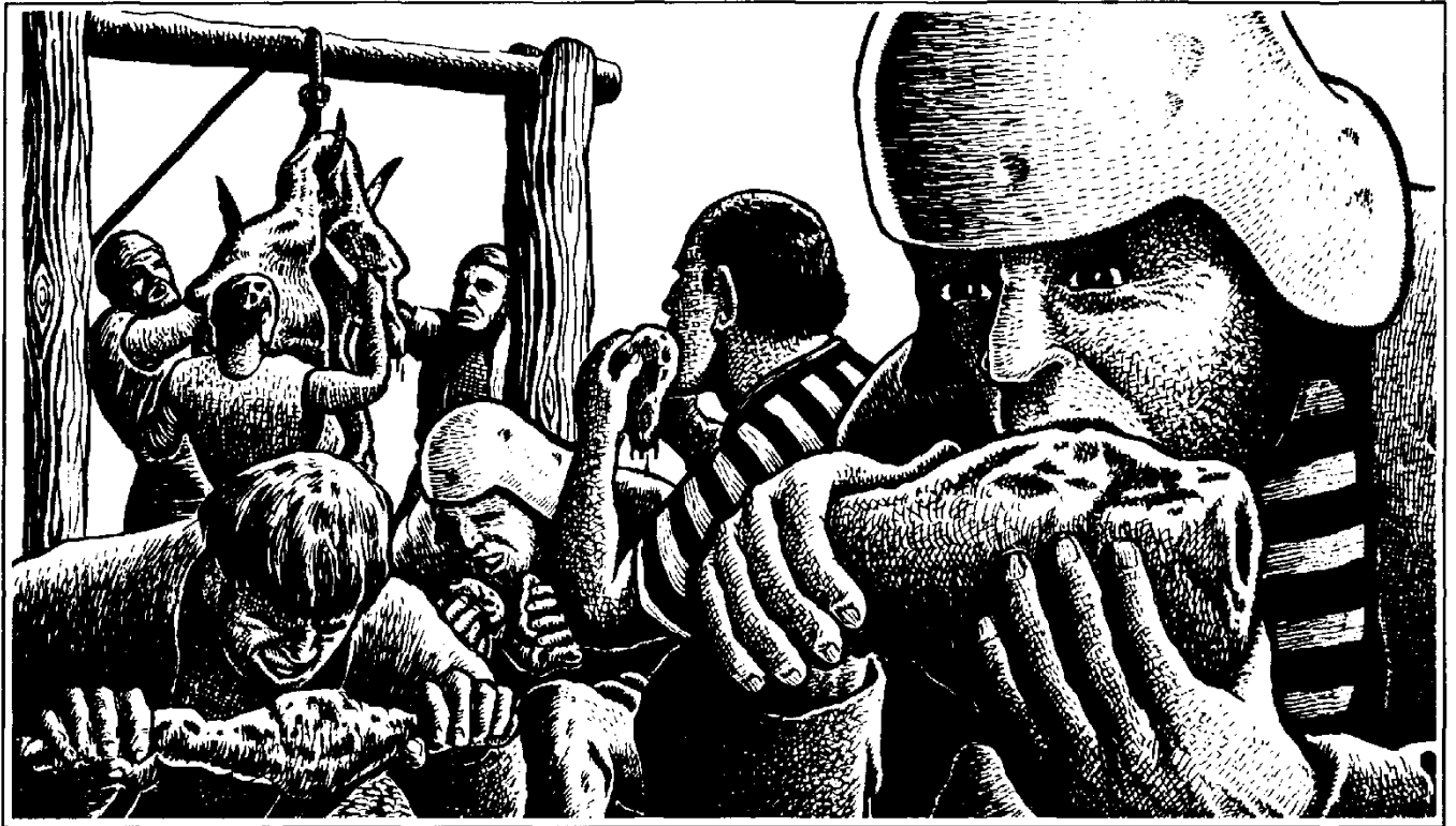
Saul's men hastily gorge themselves on the raw meat of the butchered animals.