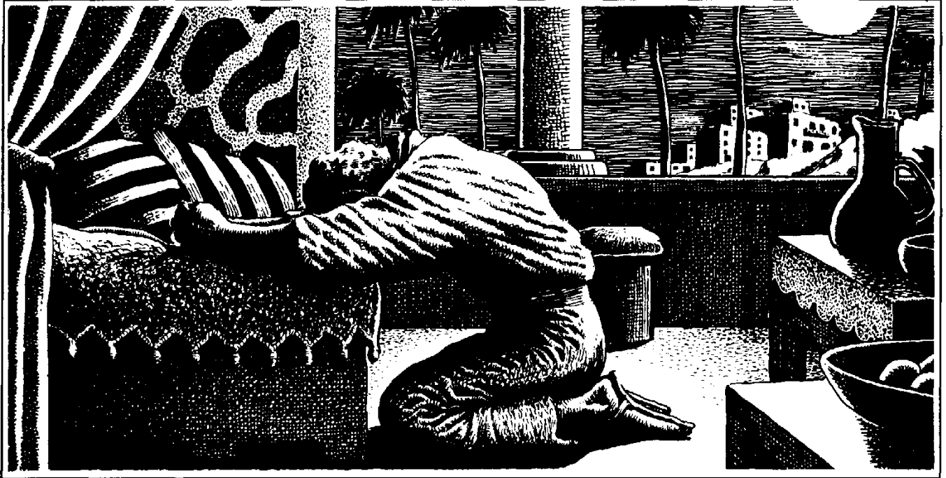
Samuel prayed all night after learning that God no longer wanted Saul to be king of Israel.