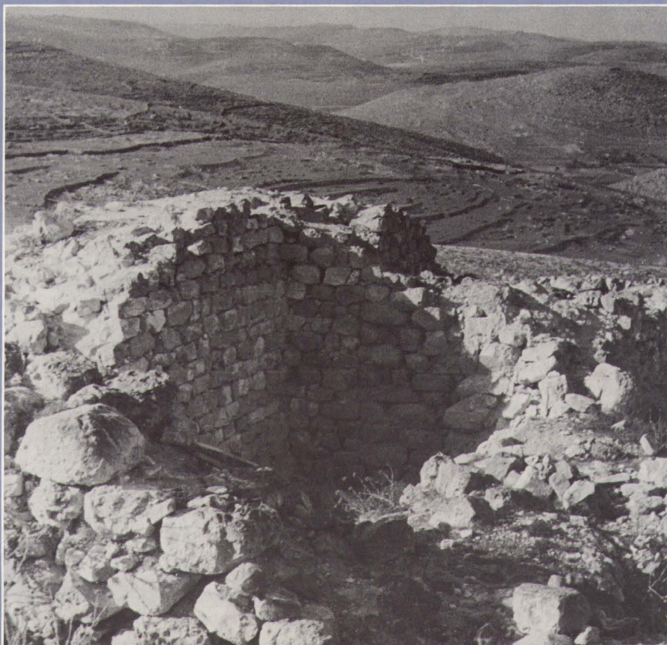
Saul Becomes King of Israel