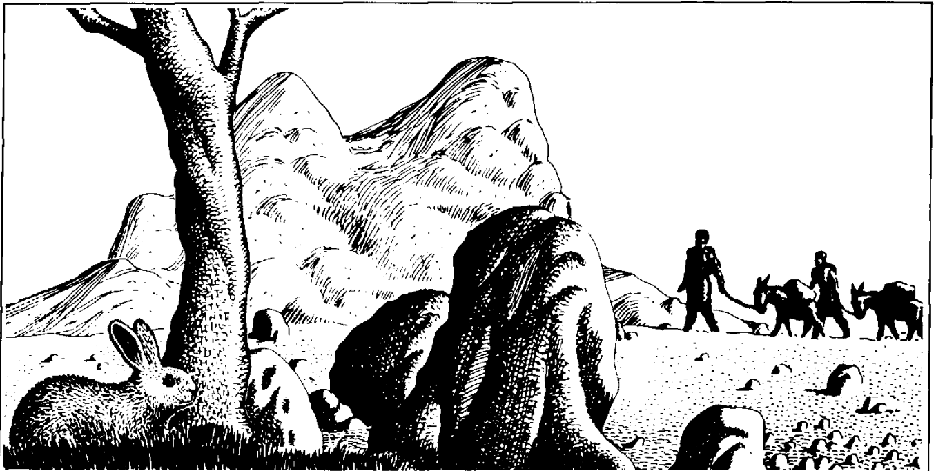
Saul and a servant search for his father's donkeys.