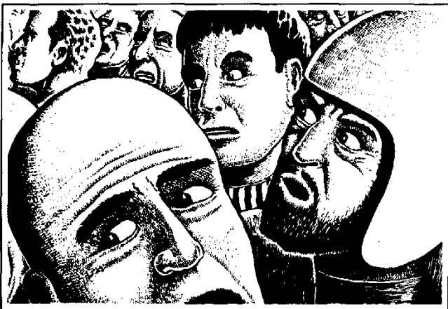
The Philistines were alarmed by the loud cheers coming from the Israelite camp.

The terrible tragedies that befell the nation came to pass as God had said. These events would not have occurred