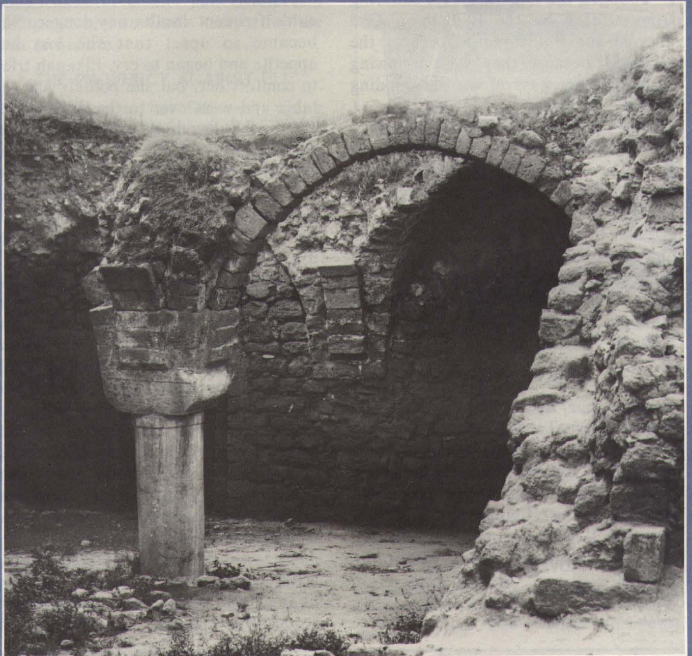
Samuel—Last Judge of Israel