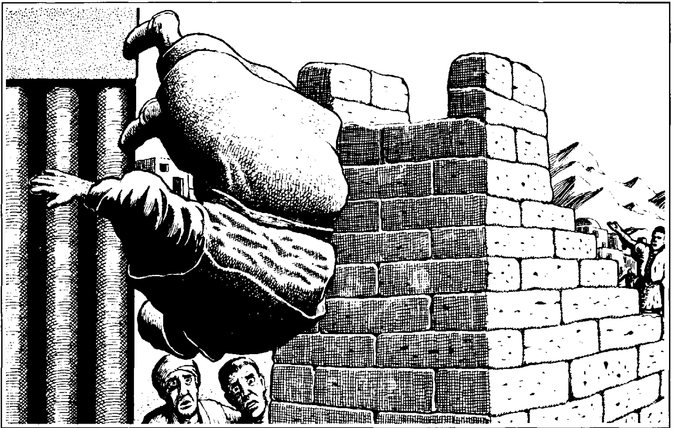
Eli was so shocked at the news that he fell from his elevated chair, killing himself in the fall.