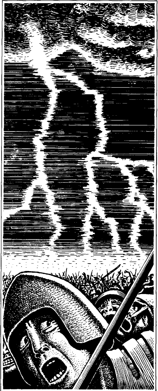
God answered Samuel's prayer by sending a terrifying thunderstorm upon the Philistines.

Samuel judged Israel for many years. When he was old, he made his two sons, Joel and Abiah, judges over Israel. Unknown to Samuel, they did not follow