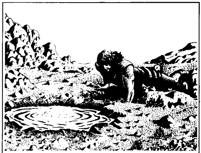
God caused a spring of cool, clear water to bubble up, thus saving Samson's life.

But Samson outfoxed them by leaving the inn at midnight. When he reached the main gates of the city, he discovered they were locked and barred.