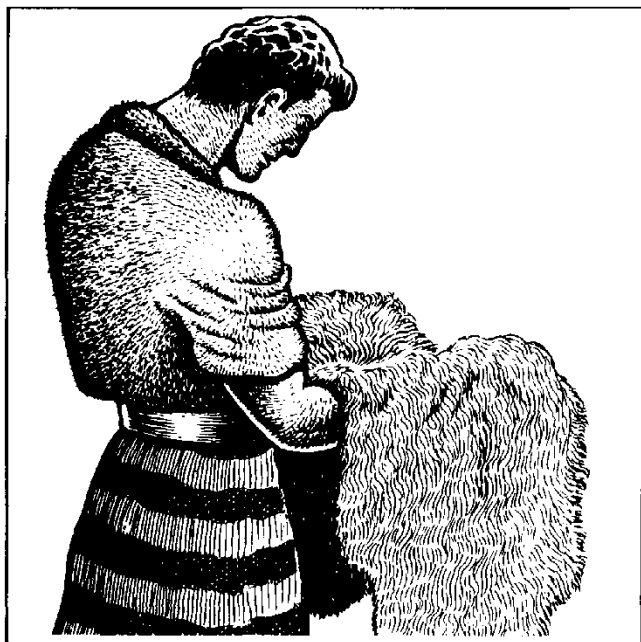
Gideon holds the fleece that proved God had chosen him to lead Israel against the Midianites.

But Gideon wanted another sign. “I will lay the fleece out again tonight,”