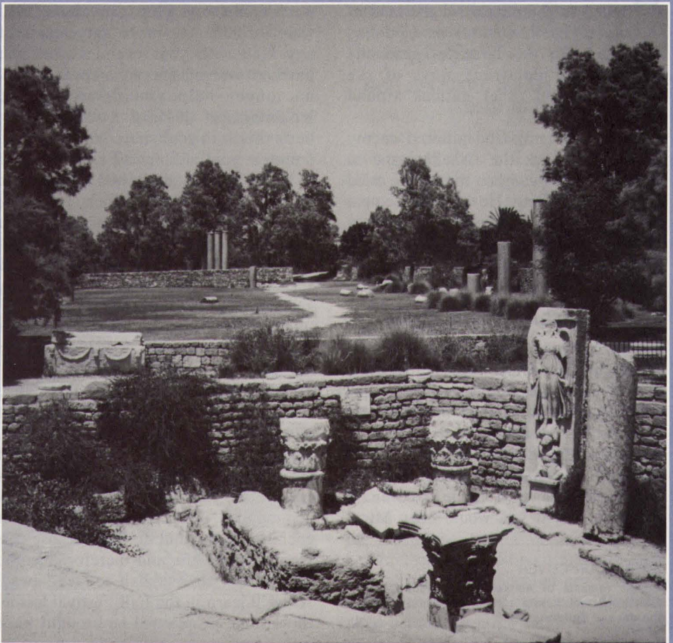
Israel During the Time of the Judges