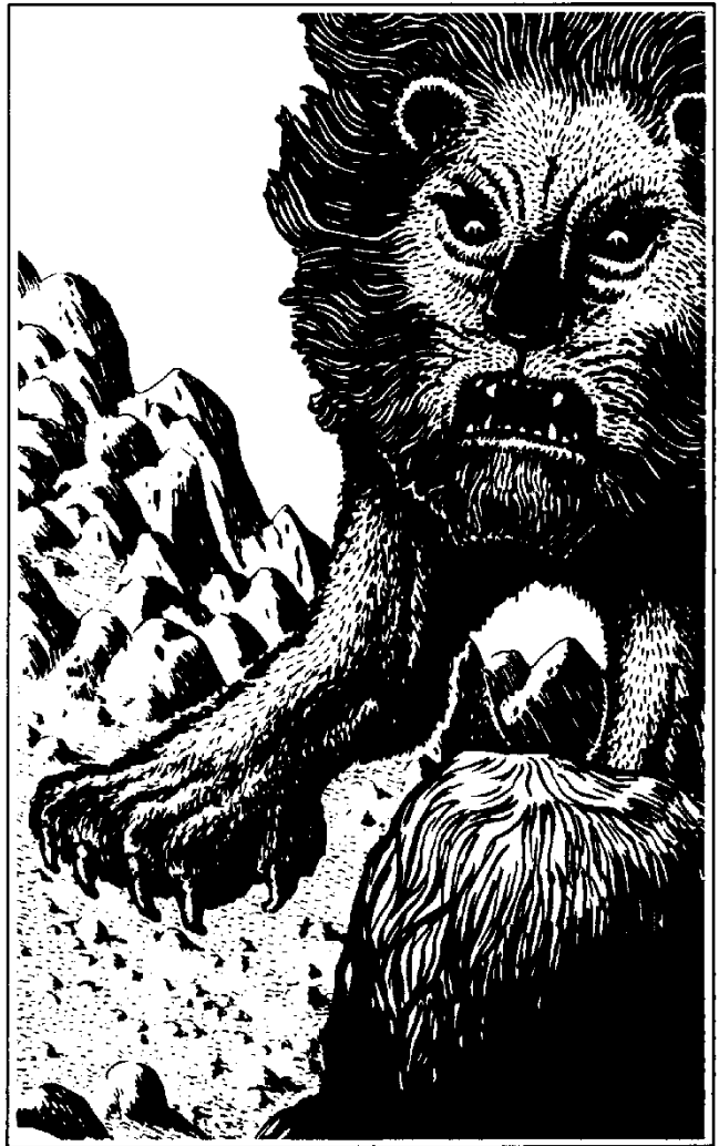
Samson quickly killed the fierce lion with his bare hands!

liked Philistine women. One day he met a young lady he wanted to marry. His parents were greatly upset by this, but Samson insisted on the marriage (Judges 14:1-4).