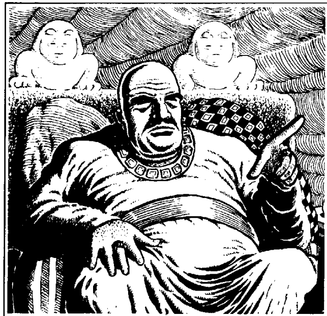
King Eglon demanded that Ehad tell him the secret message.

Ehad quietly left the room, locking the door behind him. By the time Eglon's body was discovered, Ehad had