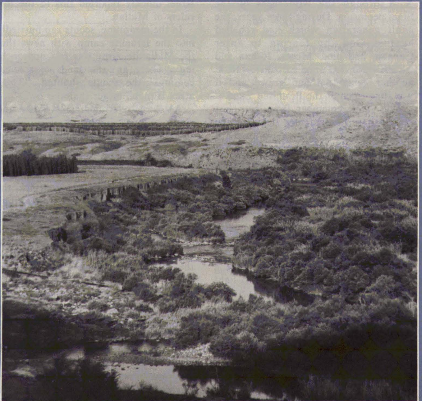
Israel Enters the Promised Land