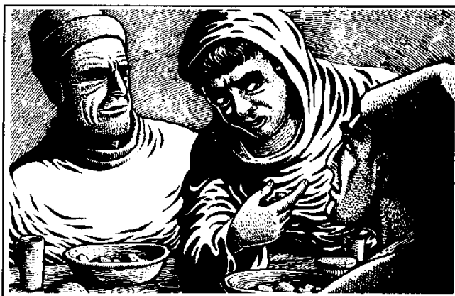
Rahab informed the two spies that soldiers had come to arrest them.

Before the Israelites entered Canaan, Joshua sent two spies across the Jordan River to the city of Jericho. Jericho was a major city along one of the trade roads through Canaan. The spies, dressed as Canaanite travelers, walked through the large gateway and into the city. As they