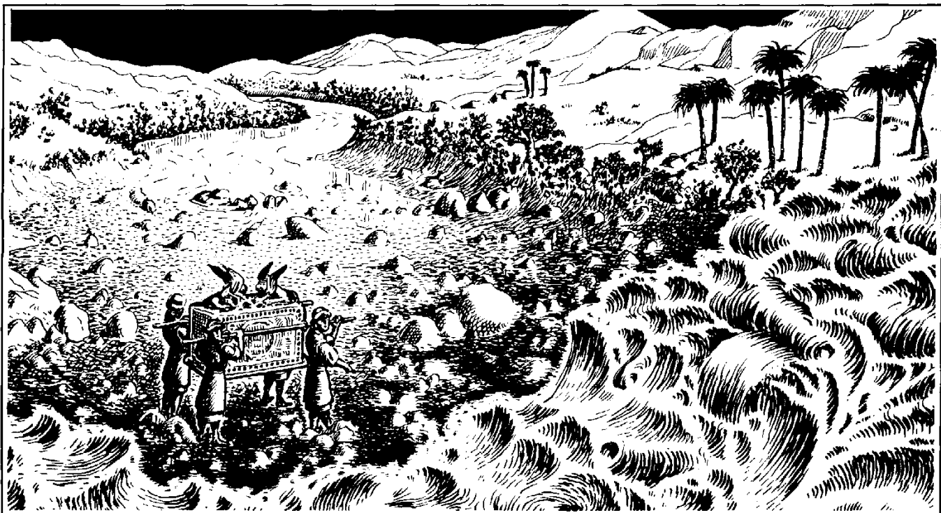
God held back the water of the Jordan River when the priests stepped into the water.

The next morning, Joshua rose early to prepare the army of Israel to march on Jericho. God had given very specific instructions as to what Israel was to do. According to God’s instructions, all the mighty men of Israel were to march