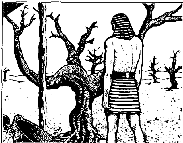
Pharaoh’s dream revealed that Egypt would be stricken with seven years of severe famine.

After carefully considering the matter, and deciding that Joseph’s advice was good, Pharaoh asked his advisors, “Where can we find such a man as this to oversee our farming? What better man could there be but Joseph, in whom the Spirit of God dwells?” They agreed that Joseph should do the job.