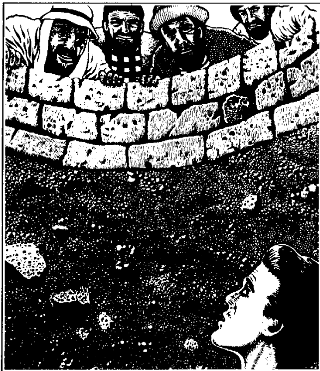
Midianite slave traders agreed to buy Joseph for twenty pieces of silver.

he again unwisely related to his brothers. In this dream he saw the sun, moon and eleven stars bowing before him. When Israel heard about the dream he rebuked Joseph. "Shall your mother and I and your brothers bow down before you?" (Genesis 37:9-11.)