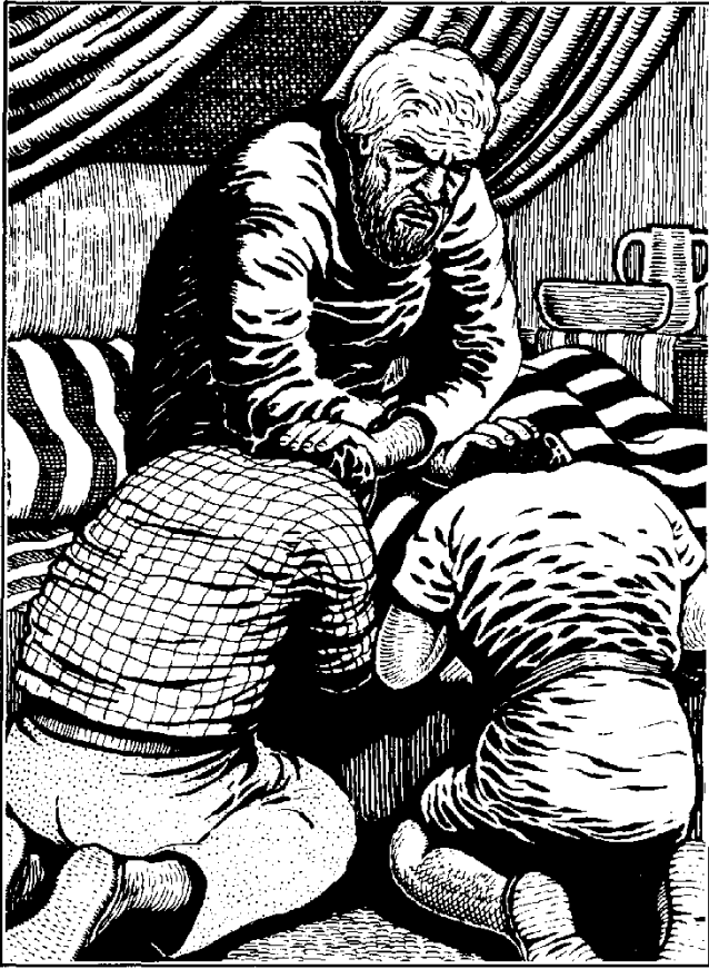
Israel asked God to greatly bless his grandsons, Ephraim and Manasseh.

would become. The forty-ninth chapter of Genesis records the prophetic words God inspired Israel to speak. Read this chapter with your parents and discuss the meaning of the prophetic remarks Israel made about each of his sons.