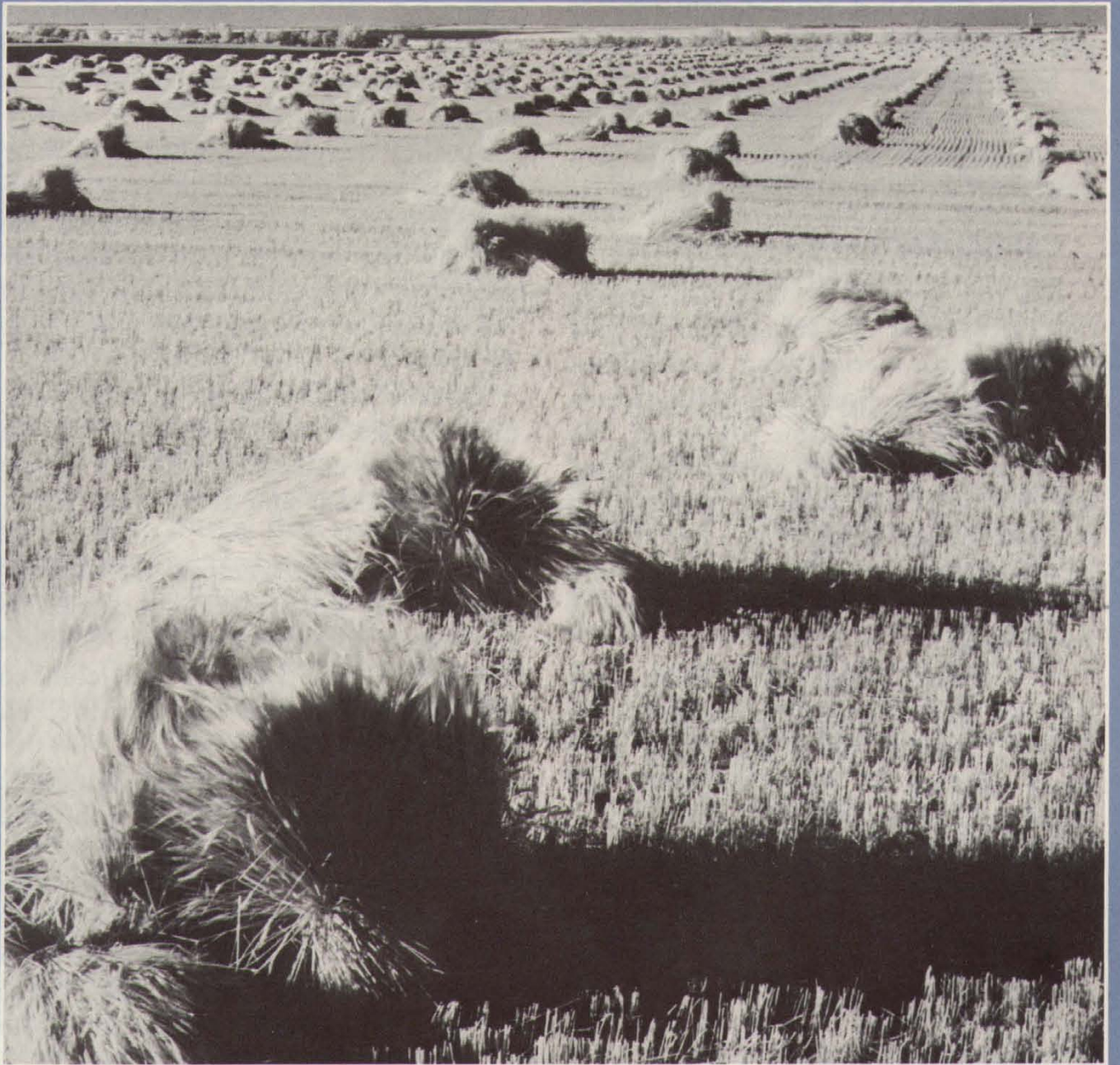
The Fathers of the Promises