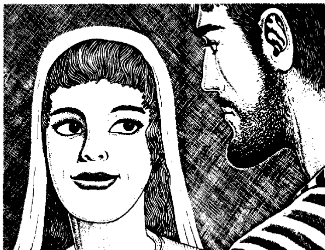
Isaac was impressed with Rebekah's beauty and good manners when he met her.

When Isaac met Rebekah he was impressed by her good manners and beauty. They were married shortly after her arrival (Gen. 24:67). Through this