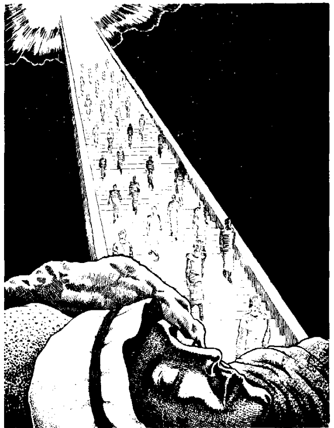
Using a stone for a pillow, the weary Jacob dreamed of a huge stairway descending from heaven.