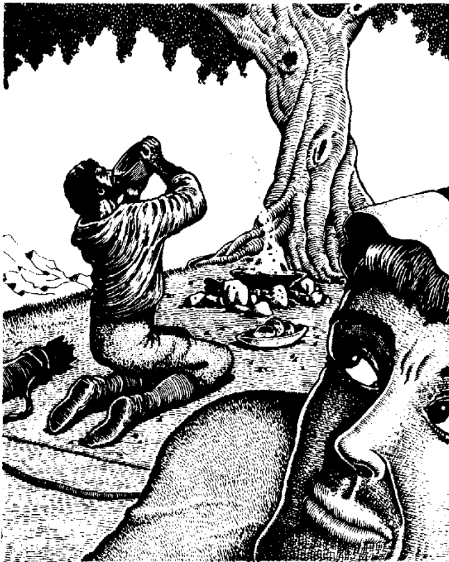
Jacob smiled triumphantly to himself as he watched his brother bolt down the food that cost Esau his birthright.

Years passed and another event occurred between these brothers that greatly affected the remainder of their lives and the lives of their future descendants.