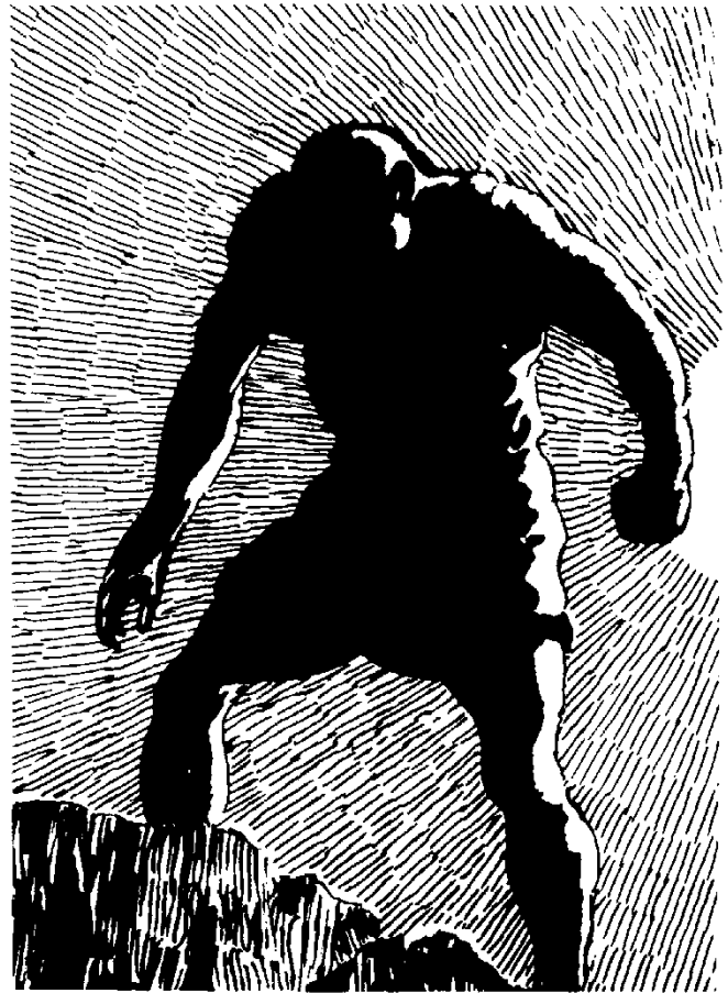
Cain called out to God, “My punishment is more than I can bear.”

Once again, God had to punish one of His human children for disobedience. But God’s punishment is always done in love and for a reason. God doesn’t punish out of hate. He doesn’t seek to get even with the sinner or to make him pay for his