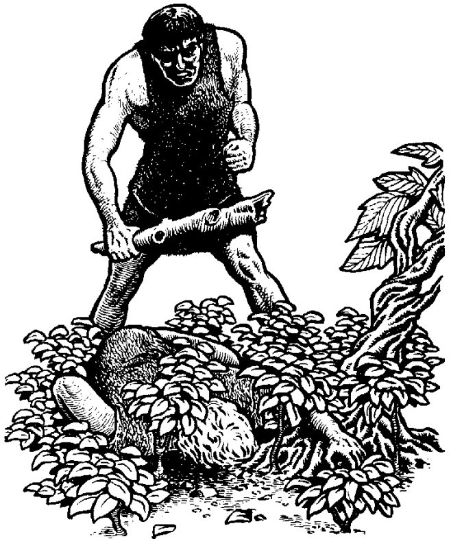
By allowing hate to control his mind, Cain became the world's first murderer!

Shortly after this, when Cain and Abel were alone in the field, Cain turned on his