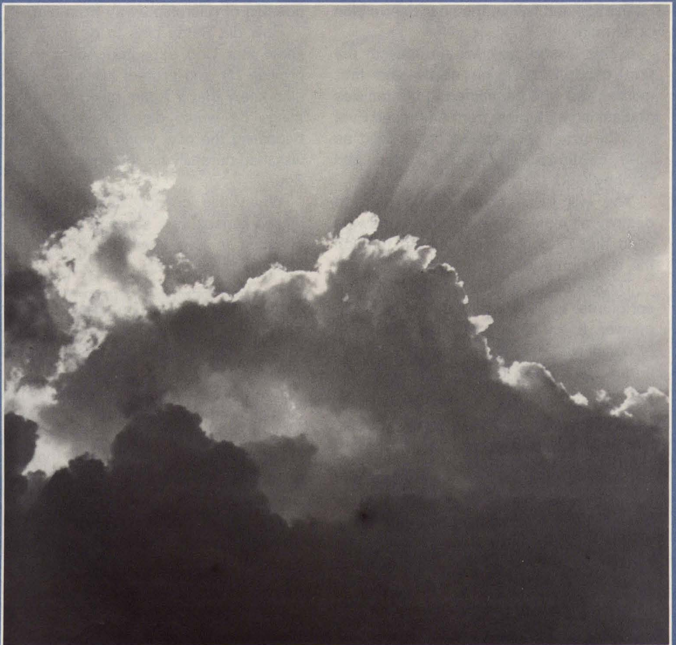
Man's History Begins