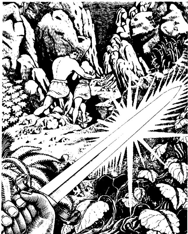
"God placed angels and a blazing sword at the only entrance to the Garden."

God also drove them out of their beautiful garden home. He knew it would be cruel to allow them to eat of the Tree of Life and live in unhappiness forever. God placed angels and a blazing sword at the only entrance to the Garden. They stopped anyone from entering the Garden