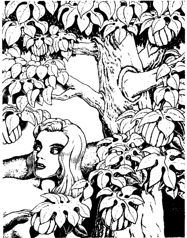
Eve finally gave in to temptation and took the fruit of the forbidden tree and ate it.

Satan, the sneaky serpent, had cleverly deceived Eve into believing his lies. She had been tricked. Eve didn’t know that she was making the wrong choice.