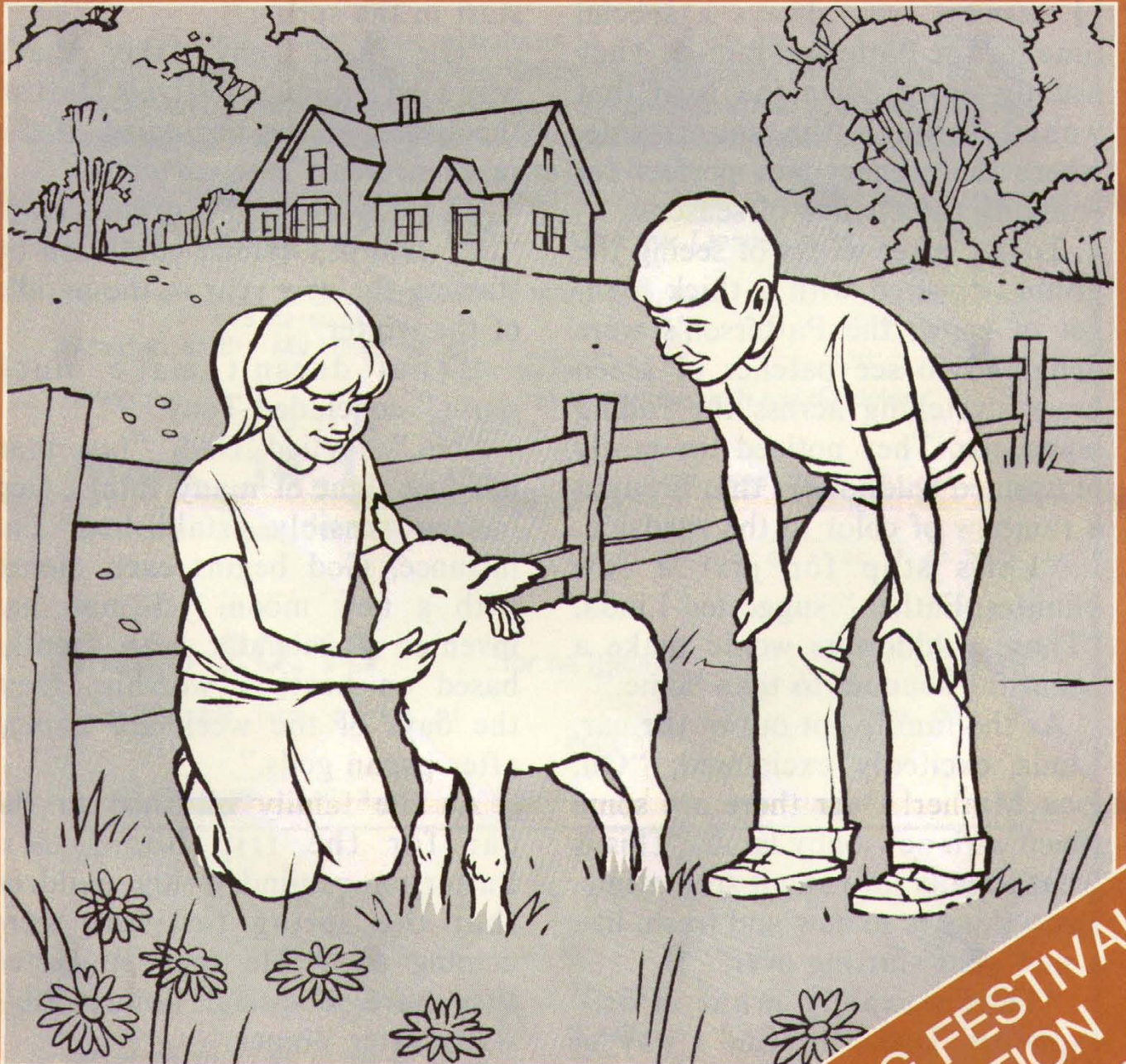
The Spring Feasts