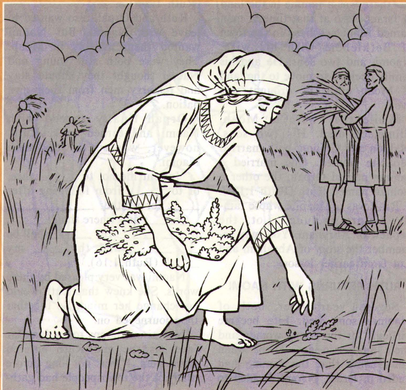
Ruth—A Virtuous Woman