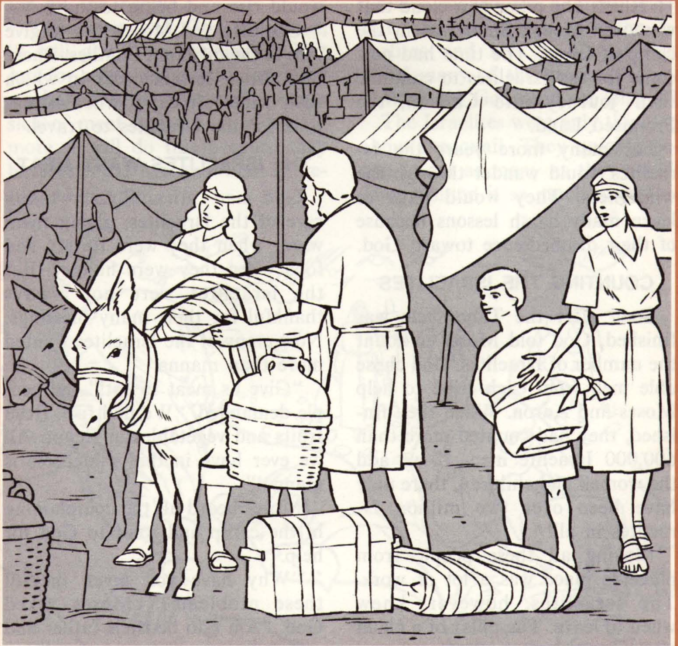
Forty Years in the Wilderness