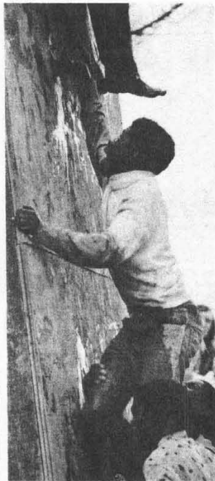
ESTCOURT, SOUTH AFRICA