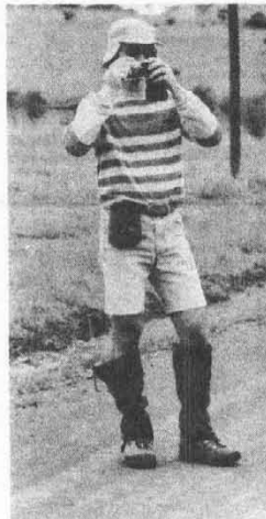
ESTCOURT, SOUTH AFRICA