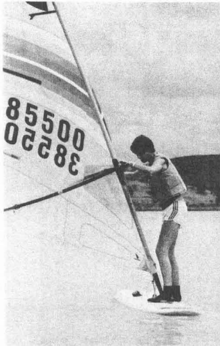
ESTCOURT, SOUTH AFRICA