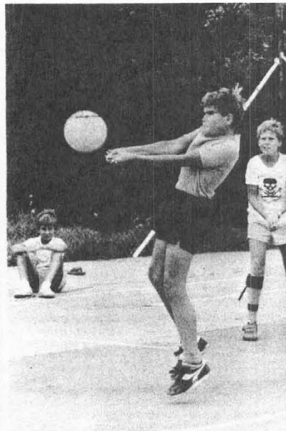
ESTCOURT, SOUTH AFRICA