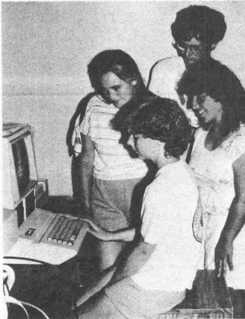
ESTCOURT, SOUTH AFRICA

The program included education classes and side trips to scenic areas and aspects of New Zealand's agricultural heritage. Other activities on the trip included river rafting, a visit to the Mount Nicholas sheep and cattle station