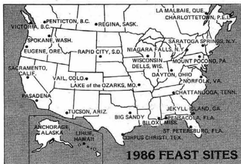
1986 FESTIVAL — Map shows 22 U.S. sites, including a new site in Chattanooga, Tenn., and six Canadian sites scheduled for the 1986 Feast of Tabernacles. La Malbaie, Que., is a new site for Canada.