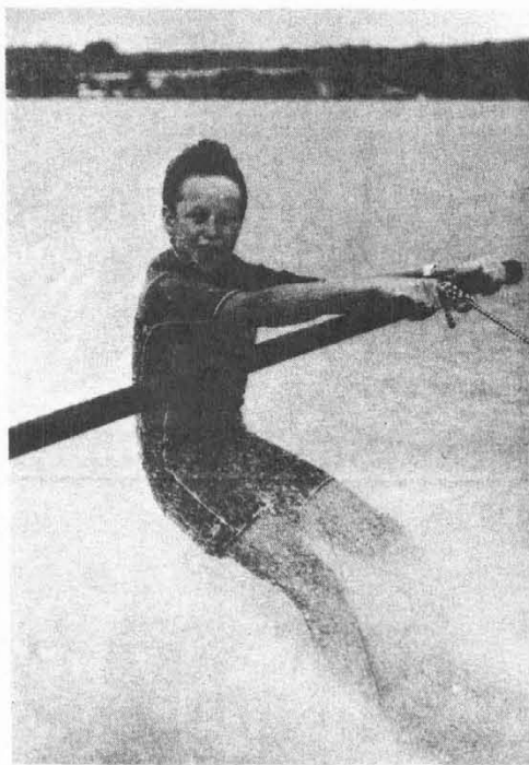
ESTCOURT, SOUTH AFRICA

Campers commented that the increased amount of individual coaching helped them to master the fundamentals of various sports. A record number of campers received first-class or expert certificates in waterskiing.