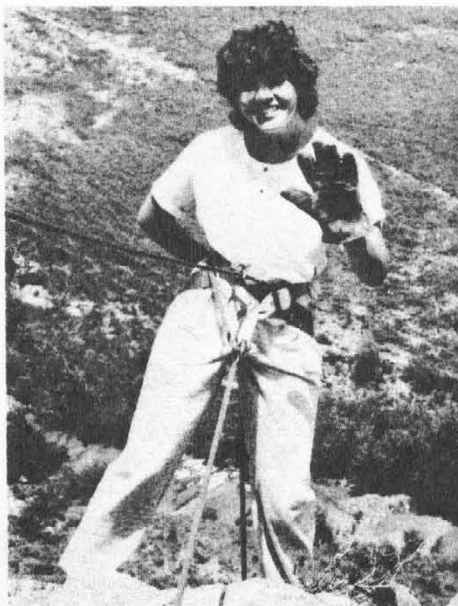
ESTCOURT, SOUTH AFRICA