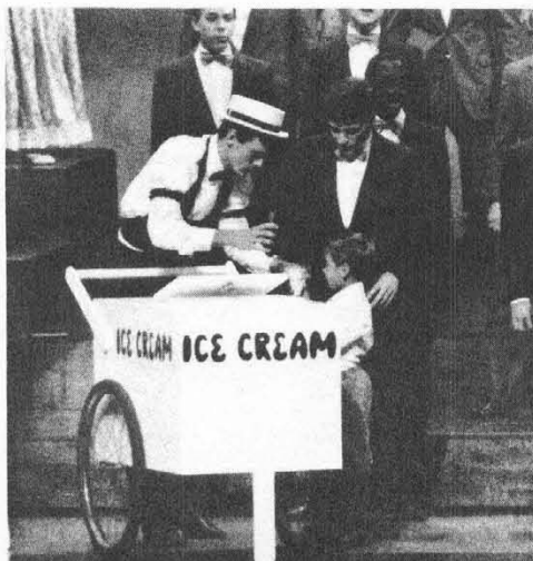
IMPERIAL GALA — Students from Imperial Schools in Pasadena take part in the presentation A Century of Song , the annual school musical production in the Ambassador Auditorium Feb. 13.

But our Creator had a contingency plan. He confused the one language of humankind and from Babel "the Lord scattered them abroad over the face of the whole earth" (verse 9). Has mankind yet to learn the lesson of the Tower of Babel?