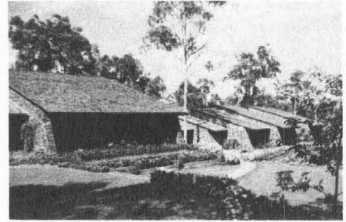
REGIONAL OFFICE IN BURLEIGH HEADS, AUSTRALIA