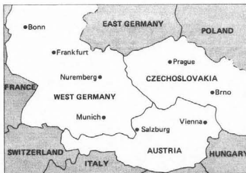
FEAST TOURS — The German Office announced four package tours for the 1986 Feast of Tabernacles in Brno, Czechoslovakia. The tours begin in Frankfurt, West Germany; Vienna, Austria; and Prague, Czechoslovakia.

Other transfers please write by airmail to Ambassador College, FOT Brno, Poppelsdorfer Allee 53, D-5300 Bonn 1, West Germany, or call 49-228-260050.