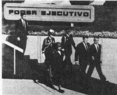
MEXICALI SUMMIT — President Miguel de la Madrid of Mexico, far right, escorts his guest, U.S. President Ronald Reagan, from speakers stand in front of the state executive building in Mexicali, Mexico. The two leaders met for a summit conference Jan. 3.

The Oct. 1 Wall Street Journal reported: "As Mexicans are fond of pointing out: 'Mexico can make Bank of America disappear; Bank of America can't make Mexico disappear.' BankAmerica Corp. and sev-