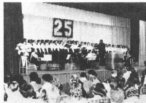
QUARTER CENTURY — The combined choirs from Brooklyn, Queens, Manhattan and Long Island, N.Y., perform at Sabbath services Nov. 24 to commemorate the New York church's 25th anniversary.