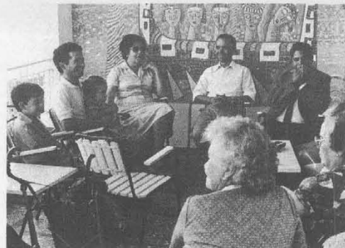
SPANISH FEAST — Brethren from Spain, Portugal and Colombia relax after Festival services in Cullera, Spain. Space is available for 75 transfers to the site in 1984.

Round-trip land transportation from Bogota, Colombia, to Melgar is about $20 per person and takes about three hours each way.