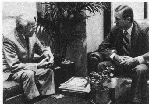
CALIFORNIA SENATOR — Pastor General Herbert W. Armstrong explains activities of the Ambassador Foundation to Senator Pete Wilson (right) of California at the senator's office in Washington, D.C., Feb. 27.

The presidential box was occupied by George Bush, U.S. vice president; George Shultz, U.S. sec- (See HWA, page 12)