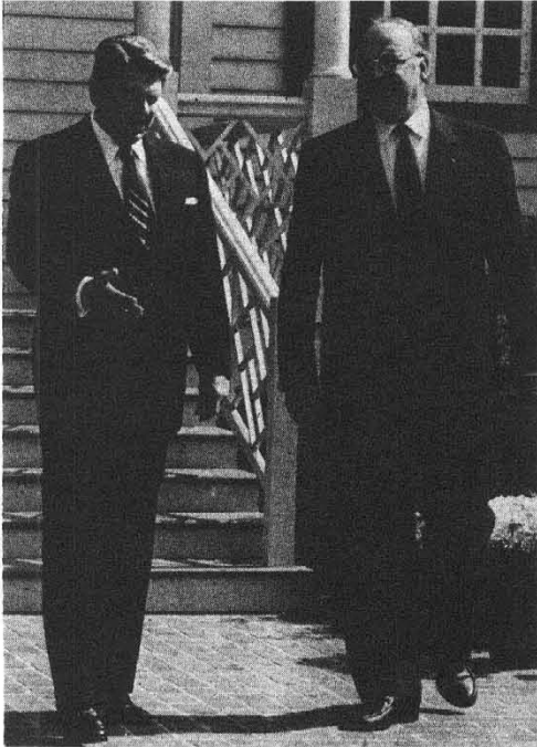
ECONOMIC SUMMIT — U.S. President Ronald Reagan (left) strolls with Helmut Kohl, chancellor of West Germany, at the Summit of Industrialized Nations in Williamsburg, Va. May 28-30. (See "Worldwatch," page 2.)