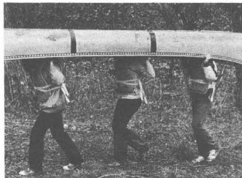
CANOE TRIP —Teens from Buffalo, N.Y., and Toronto, Ont., East portage their canoes during a canoe trip in western New York May 1. (See "Youth Activities," page 7.)