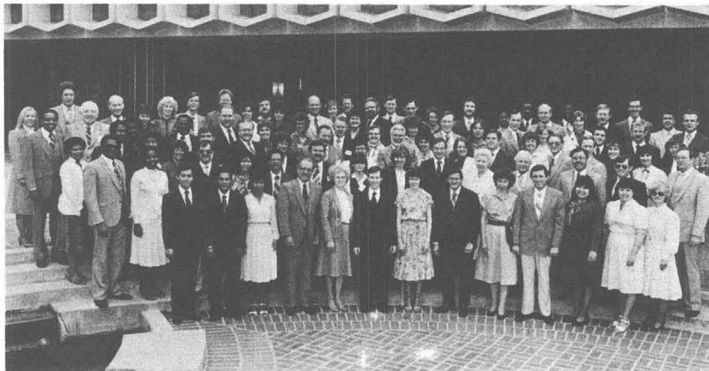
PASADENA PROGRAM — Ministers and wives attending the May 30 to June 9 Ministerial Refreshing Program take time out for a photo at the Loma D. Armstrong Academic Center on the Pasadena Ambassador College campus June 3. Individuals from Trinidad, Canada, New Zealand, England, Nigeria, Australia, Mauritius, Malaysia, the Philippines and the United States attended.