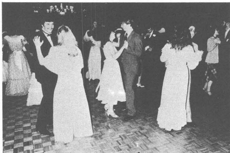
YOU PROM — Teens from the Meriden, Conn., area dance at the Buckboard in Glastonbury, Conn., April 30. (See "Youth Activities," page 7.)