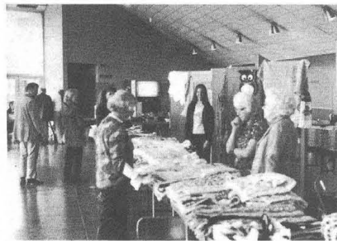
CRAFT BAZAAR — Quilts, blankets and other crafts are displayed at the Salem and Albany, Ore., churches' annual craft bazaar Nov. 28, which raised $1,800 for the Work. (See "Church Activities," this page.)