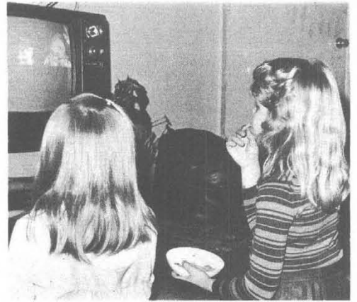
ELECTRONIC BABY-SITTER — When single parents must work, children often watch television as a pastime after school until the parent arrives home.

Your duty as a parent is to provide a well-balanced, happy atmosphere for your family. Plan your meals so that they contribute to family health and togetherness.