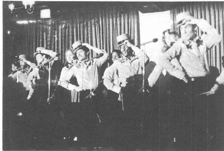
SINGING AMBASSADORS — The Young Ambassadors perform for the Pasadena branch of the National Exchange Club, a community service organization, Dec. 29, 1982. The Pasadena-based group performs for other community organizations, including Tournament of Roses functions, according to the Music Services Department.