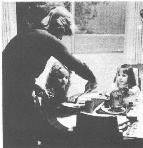
INCREASED RESPONSIBILITY — Mothers in single-parent homes face the responsibility of being both breadwinners and bread makers. Church members are admonished to volunteer assistance (James 1:27).

"You have got to get a balance. Instead of fear, people need a healthy respect for caution."