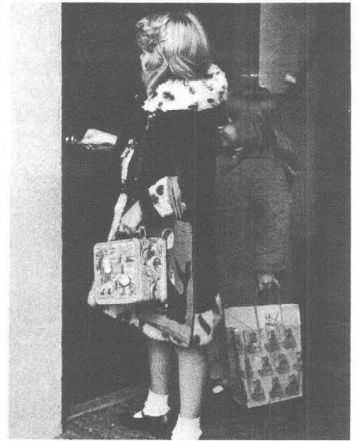
LATCH-KEY KIDS — Working mothers and fathers mean increasing numbers of children in the United States, England and other countries come home to empty houses.