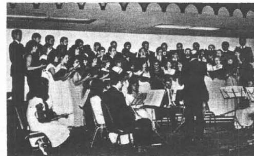
SPECIAL MUSIC — The Pasadena Church Choir and Chamber Ensemble perform at the Tijuana and Mexicali, Mexico, combined Sabbath services Aug. 21 in Tijuana. (See "Church Activities," page 7.)