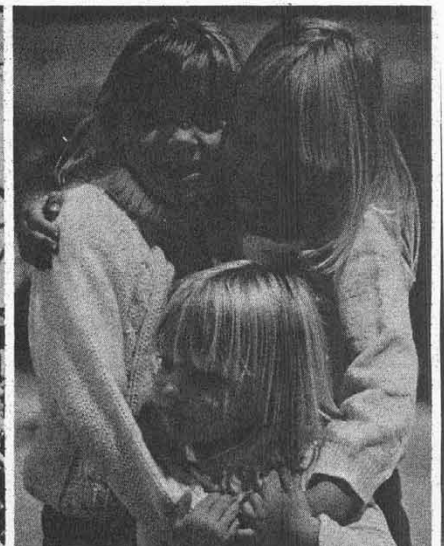
RAPID CITY, S.D.