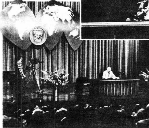
SATELLITE MESSAGE — Pastor General Herbert W. Armstrong greets U.S. and Canadian brethren on the Last Great Day, Oct. 9, above. He spoke to more than 110,000 live by satellite and microwave relays seven days earlier. Left, the pastor general explains the overall purpose of God's plan Oct. 9. "It has become my custom now in these latter days," he said, "to stay with the trunk of the tree of the Gospel and of the message that God wants delivered to you brethren."

The next afternoon the cameras (See SATELLITE , page 16)