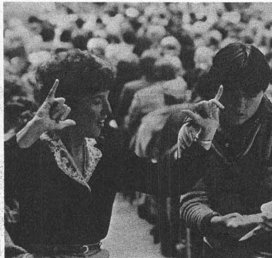
SQUAW VALLEY, CALIF.