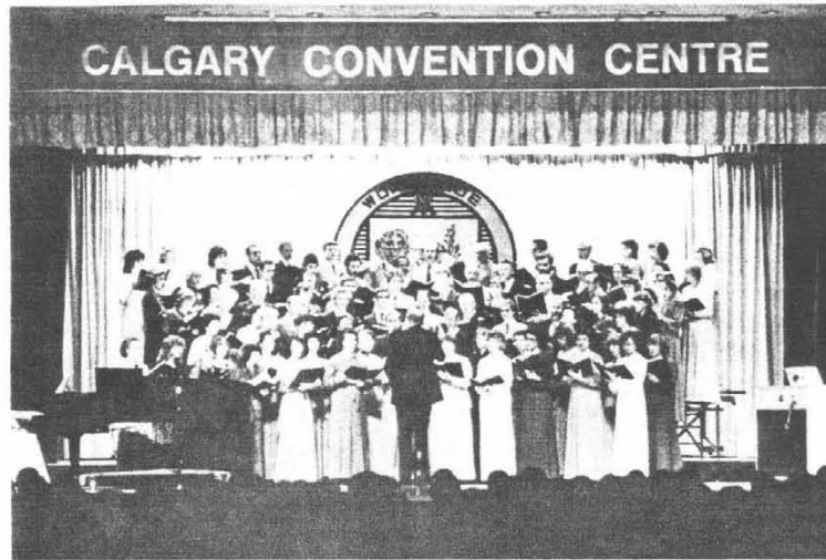
A FEAST OF SONG — The Festival choir in Calgary, Alta., performs special music during the Feast of Tabernacles.