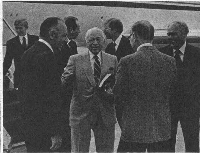
LAKE OF THE OZARKS, MO.