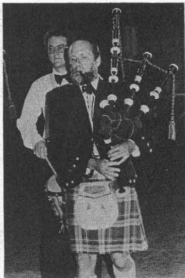
DURBAN, SOUTH AFRICA