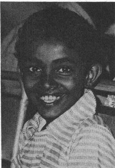
BENTOTA, SRI LANKA