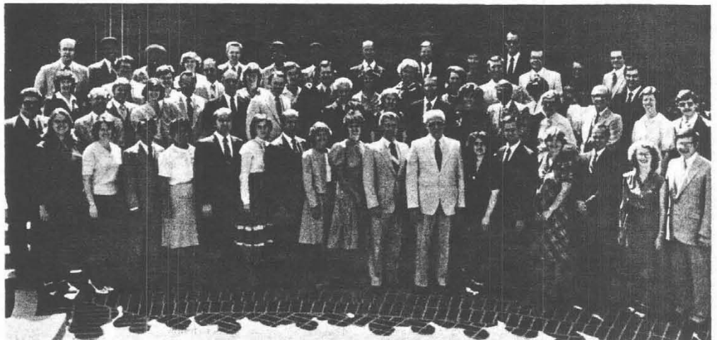
REFRESHING PROGRAM — Ministers and wives participating in the 10th session of the Ministerial Refreshing Program Aug. 30 to Sept. 9 gather for a photo at the Loma D. Armstrong Academic Center on the Pasadena Ambassador College campus Sept. 2. Ministers and wives attended from Northern Ireland, Australia, New Zealand, Canada, the Philippines, Trinidad, South Africa and the United States.