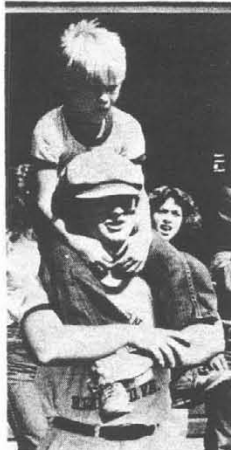
UP HE GOES — Two Feastgoers in Norfolk, Va., cooperate to provide a better view of proceedings.