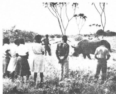
GAME VIEWING — Young people of the Kibirichia, Kenya, church observe a rhino during an outing to the Meru National Park Aug. 15 and 16. (See "Youth Activities," page 12.)

The LETHBRIDGE, Alta., church conducted its first orienteering outing