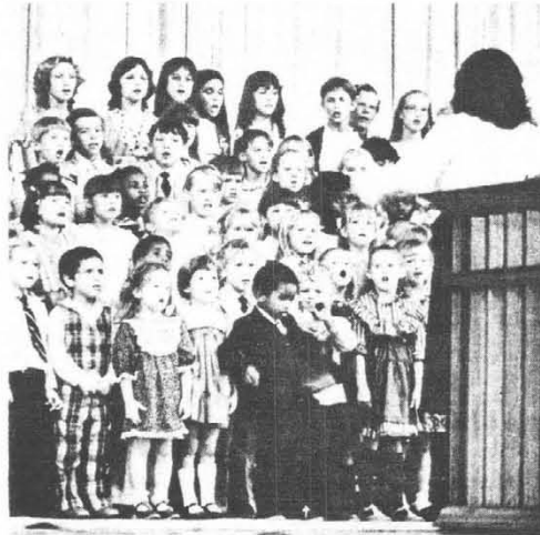
SPECIAL MUSIC — A children's choir performs during Feast of Tabernacles services in Big Sandy, Tex.