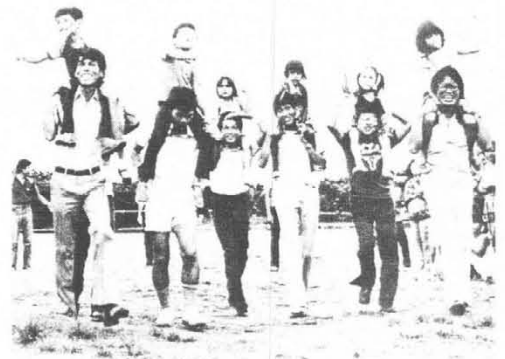
ANNIVERSARY ACTIVITY — Philippine brethren hoist sons and daughters to shoulders in a contest to shoot bamboo sticks through rings during 20th anniversary celebrations of the Manila, Philippines, Office Aug. 22.

The second activity was a barrio fiesta (church picnic) Aug. 22 on