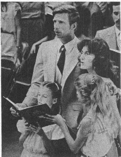
ST. PETERSBURG, FLA.