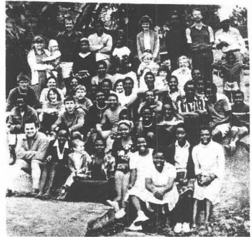
ZIMBABWEAN SEP — Youth Opportunities United (YOU) members and staff pose for a photograph Aug. 22 during the Summer Educational Camp at Lake Lesapi.