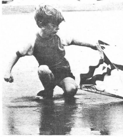
WIND, SURF AND SAND — A youthful Feastgoer prepares to launch his kite at Jekyll Island, Ga.