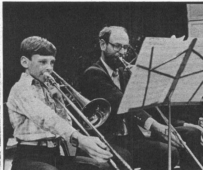
CAPE COD, MASS.