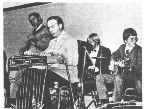
FEAST PICKIN' — Brethren try their hands at pickin' and playing during a social at the Festival in Spokane, Wash.

The deaf at Squaw Valley weren't (See 1982 FEAST, page 5)