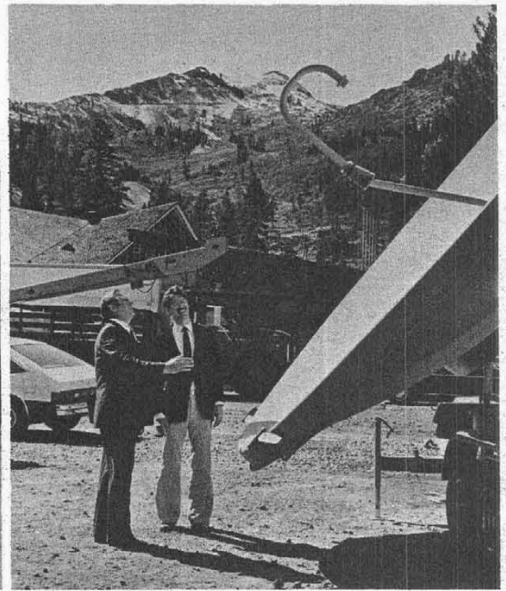
SQUAW VALLEY, CALIF.