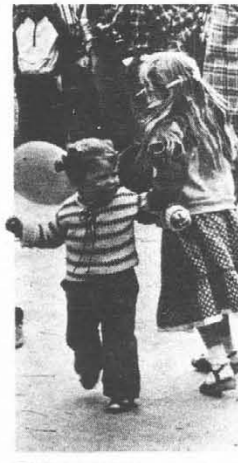
FAMILY DAY FUN — Arm in arm, two children enjoy family day Oct. 6 in Squaw Valley, Calif.