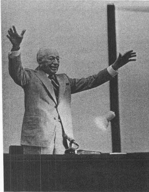
OF THE OZARKS, MO.