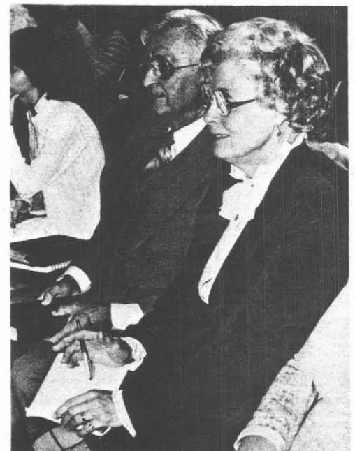
THOSE WHO HAVE EARS — Brethren listen during Feast of Tabernacles services in Mount Pocono, Pa.