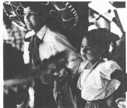
MEXICAN DANCES — Two children in the Pasadena Spanish church perform a dance at the Country Fair and Chili Cook-off in Pasadena May 16.

A portion of the proceeds taken in at the fair was donated to Imperial Schools in Pasadena.