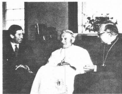
LEADERS MEET — Charles, Prince of Wales, chats with Pope John Paul II (center) and Church of England Archbishop Robert Runcie before the historic ecumenical service at Canterbury Cathedral May 29.