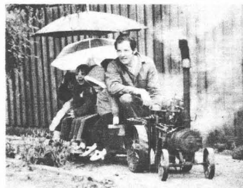
RAINY TRAIN RIDE — Children of the Melbourne, Australia, West church enjoy rides on a steam locomotive at a children's party April 25. (See "Youth Activities," this page.)

After a restaurant meal the LONDON, Ont., singles went to the home of