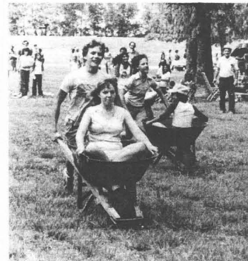
OFF AND RUNNING — New Orleans, La., brethren take part in a wheelbarrow race at a church picnic May 16. (See "Church Activities," this page.)