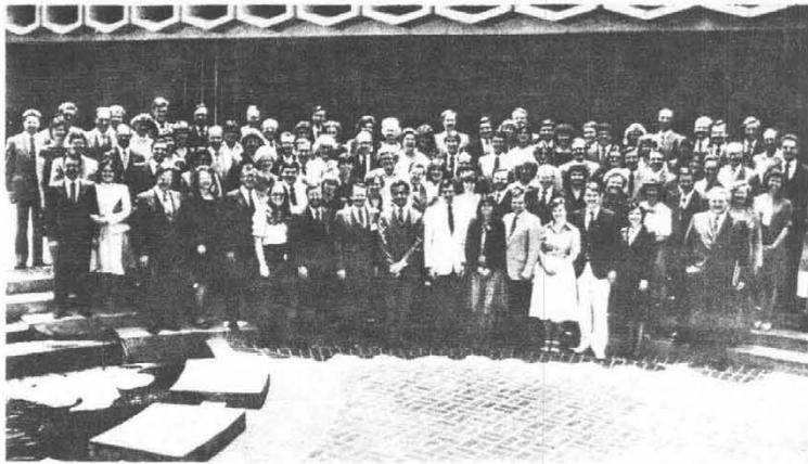
SIXTH SESSION — Ministers from the United States, Canada, Belgium and France, ministerial trainees and faculty members from the Pasadena and Big Sandy Ambassador College campuses and spouses stand on the steps of the Loma D. Armstrong Academic Center during the Ministerial Refreshing Program in Pasadena June 7 to 17.