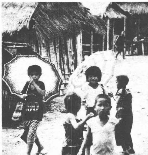
LAOTIAN REFUGEES — Children in the Ban Thong refugee camp about 9 miles (15 kilometers) from Chiang Khong, Thailand, return home from school. In the background are huts made by the refugees out of bamboo, rice straw and cardboard. Ambassador College students teach adult refugees English and aspects of Western culture.