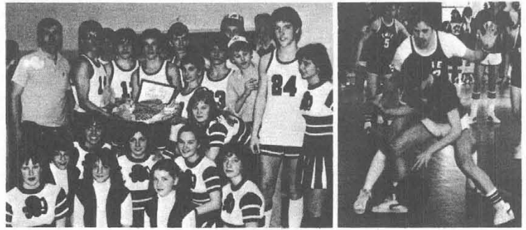
TEAM EFFORT — The Buffalo, N.Y., YOU basketball team celebrates with cheerleaders after winning the Division I title in the YOU district tournament in Buffalo March 13 and 14. Photo at right shows Division II game between Buffalo and Erie, Pa. (See "Youth Activities," this page.)

A monthly Bible study was conducted in WENTZVILLE, Mo., March 16 at