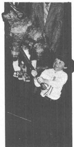
MIGHTY SWING — A youth tries to break open a pinata at a combined social of the St. Catharines and Hamilton, Ont., churches Feb. 13. (See "Church Activities," this page.)