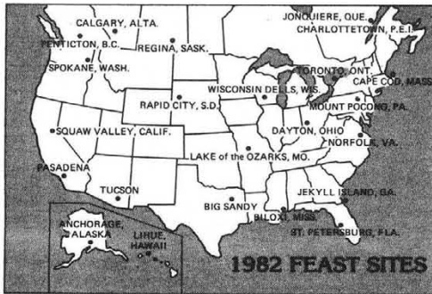
FESTIVAL SITES — Pictured above are the 1982 United States and Canadian Feast of Tabernacles sites approved by Pastor General Herbert W. Armstrong. A list of sites worldwide appears on pages 7 and 8.

Instructions for making your housing arrangements are included in this issue of The Worldwide News .