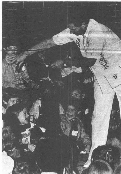
MARIONETTE SHOW — Children from the four Pasadena church congregations enjoy a marionette show March 28 at a party played host to by the Pasadena Senior Girls' Club. (See "Youth Activities," page 7.)

A YOU district family weekend took place in BUFFALO, N.Y., March 13 and 14. More than 210 brethren from (See CHURCH NEWS, page 7)