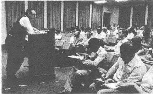
REFRESHING PROGRAM — Evangelist Joseph Tkach explains Church policy and procedures Sept. 14 to the last group of ministers and wives on the 1980-81 Refreshing Program.