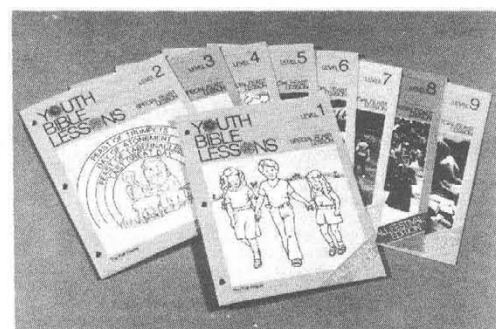
YES LESSONS — Newly printed Youth Educational Services (YES) lessons (above) for the 1981 Feast of Tabernacles were mailed during the week ending Sept. 18.