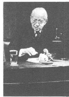
CHANCELLOR TEACHES — Herbert W. Armstrong lectures in Ambassador College's principles of living class Sept. 1.