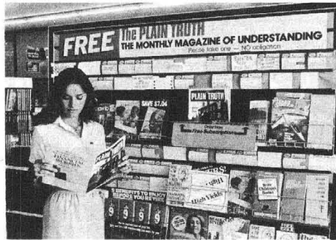
SPREADING THE GOSPEL — Pictured above is a newsstand Plain Truth display in a supermarket in Montebello, Calif. The stand is part of an 11-state program.

The lessons were prepared in conjunction with teachers at Imperial (See YES, page 3)