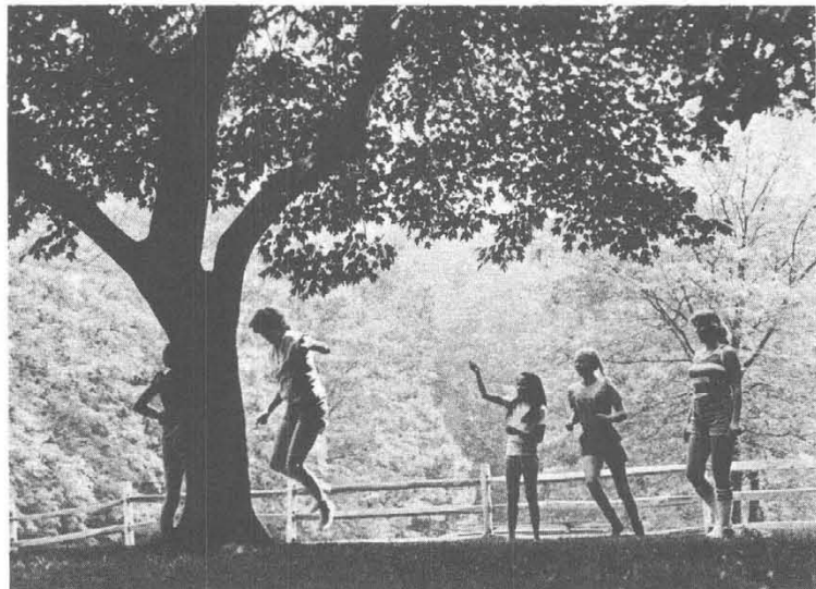
JUMPING ROPE — A group of teens jump rope at the district 12 YOU picnic in Morristown, N.J., Aug. 2. (See "Youth Activities," page 7.)