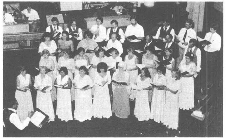
CHOIR BANQUET — The Garden Grove, Calif., church choir sings at a banquet Aug. 8. (See "Church Activities," page 4.)

About 150 brethren from the YOUNGSTOWN , Ohio, and MERCER , Pa., churches attended a marriage seminar conducted by pastor Eugene Noel at Thiel College in Greenville, Pa.,