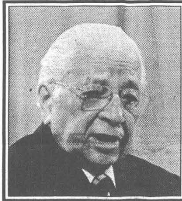
HERBERT W. ARMSTRONG

One might not think, until looking more deeply, that organized labor has contributed its share to the present problems of unemployment, inflation,