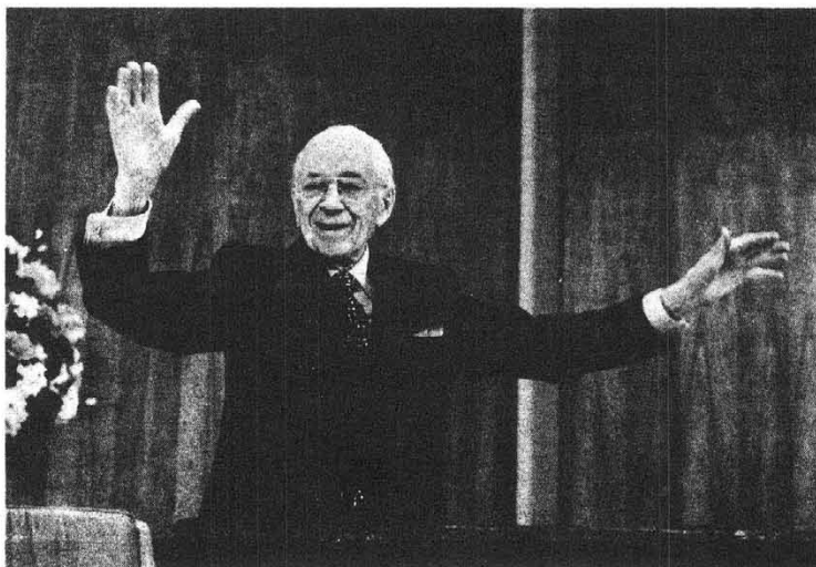
CONGRESS OF MINISTERS — Pastor General Herbert W. Armstrong accepts applause after addressing a congress of leading ministers of the Worldwide Church of God in the Ambassador College Recital Hall in Pasadena Feb. 25.

Secondly, this necessitates a dynamic stepping up in the intensity of God's Work by His Church, proclaiming Christ's Gospel of the coming Kingdom of God, which is not being proclaimed to the world by others and has not been for 19½ centuries to the world — except what