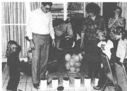
CHURCH ANNIVERSARY PARTY — Children of the Kenosha, Wis., church play a game at the celebration of the church's third anniversary Dec. 7. (See "Church Activities," page 4.)