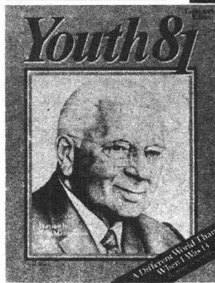
MAGAZINE BORN — Vol. 1, No. 1 of Youth & World (left) was mailed to heads of households Jan. 19, according to managing editor Dexter H. Faulkner. Right, the magazine is cut and folded. The 16-page magazine features a special cover to enhance its collector's edition value.