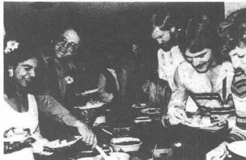
MEXICAN DINNER — Members and guests of the Pasco, Wash., Women's Club sample Mexican cuisine at a dinner Nov. 22. (See "Club Meetings," this page.)