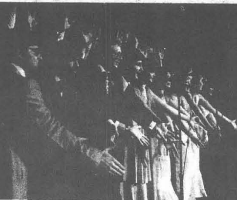
STAGE PERFORMERS — Ambassador students perform in unison during the college's Thanksgiving dance Nov. 23 in the Student Center.