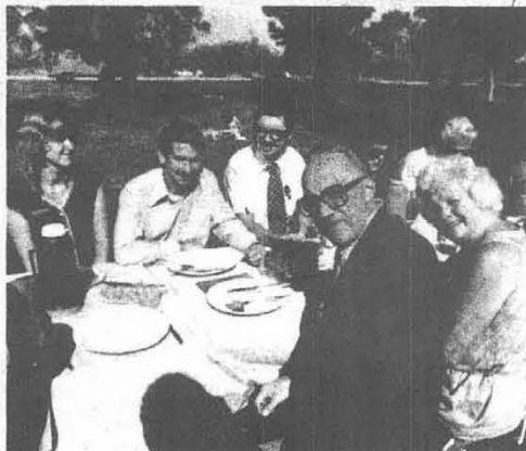
LONG BEACH, CALIF.