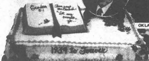
OKLAHOMA CITY, OKLA.