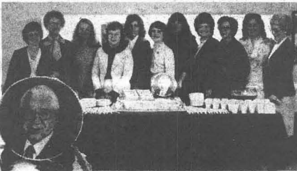
OKLAHOMA CITY, OKLA.