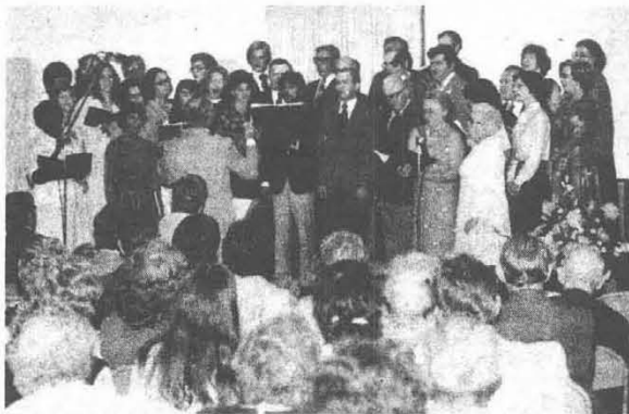
ST. PETERSBURG, FLA.

As members around the world gave thanks to God, munched on cookies and cake, and spent hours in fellowship, the reports indicated that God's Church is united, looking forward to doing its part in completing the great commission.