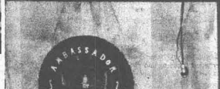
CALVERT CITY, KY.