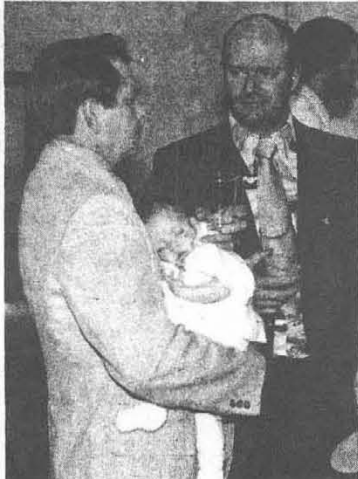
RAPID CITY, S.D.