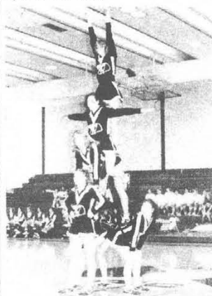
GARDEN GROVE CHEERLEADING SQUAD

PASADENA — In the April 21 "Focus on Youth" column, the cheerleading sportsmanship award to the Garden Grove, Calif., girls was inadvertently left out of the YOU National Finals article. Our apologies to the Garden Grove cheerleading squad.