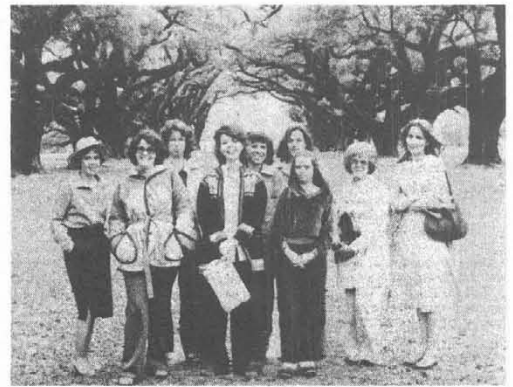
PLANTATION TOUR — Members of the Baton Rouge, La., Women's Club pose under 280-year-old live oak trees at Oak Alley Plantation. (See "Club Meetings," this page.)

Letters sent from Pasadena announced the lectures to local Plain Truth subscribers. Inserts in newsstand magazines and spot announcements at