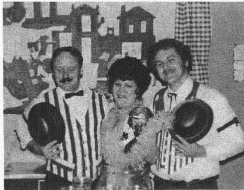
WILD WEST DANCE — Bartenders and Miss Kitty pause while serving root beer at the Shreveport, La., square dance March 8. (See "Church Activities," this page.)