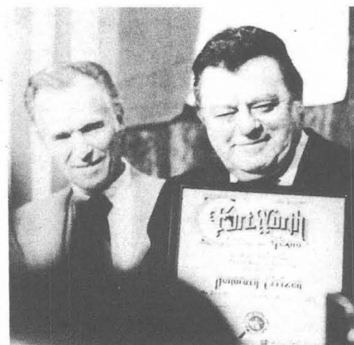
CANDIDATE — Franz Josef Strauss, right, a candidate for the chancellorship of West Germany, holds a plaque presented to him by the city of Fort Worth, Tex., on a recent visit to the area.

ADDRESS CHANGES: U.S. changes of address are handled automatically with Plain Truth changes of address. Second-class postage paid at Pasadena, Calif. Postmaster: Please send Form 3579 to: The Worldwide News , Box 111, Pasadena, Calif., 91123.