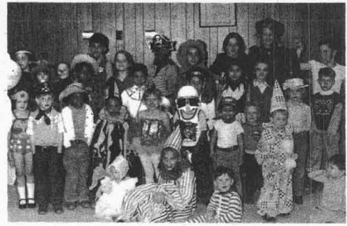
COSTUME PARTY — Children of the Montgomery, Ala., church pose in their fancy-dress costumes March 15. (See "Church Activities," this page.)