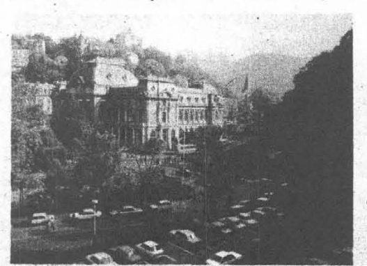
CZECHOSLOVAKIAN SITE — The meeting hall where Festival services took place in Carisbad, Czechoslovakia, shows some of the turn-of-the-century-style and architecture of the city.

chandeliers and wide marble stair. ways, the hotels especially are rem iniscent of the Austrian Empire. This year 150 people attended this site, with members coming from