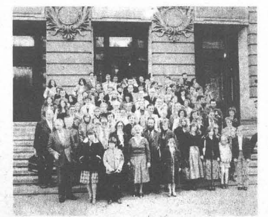
CARLSBAD FEASTGOERS — Some of the brethren attending this year's Feast of Tabernacies in Carisbad gather in front of the meeting hall.

After months of such Ping-Pong decisions, a hall was finally reserved — the day before everyone arrived. The room was decorated with turnof-the-century architecture, nor-mally only used for official state functions. During services, simultaneous translations were provided for the English-speaking members so they could also benefit from the ser-