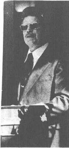
ambassador college deputy chancellor address.